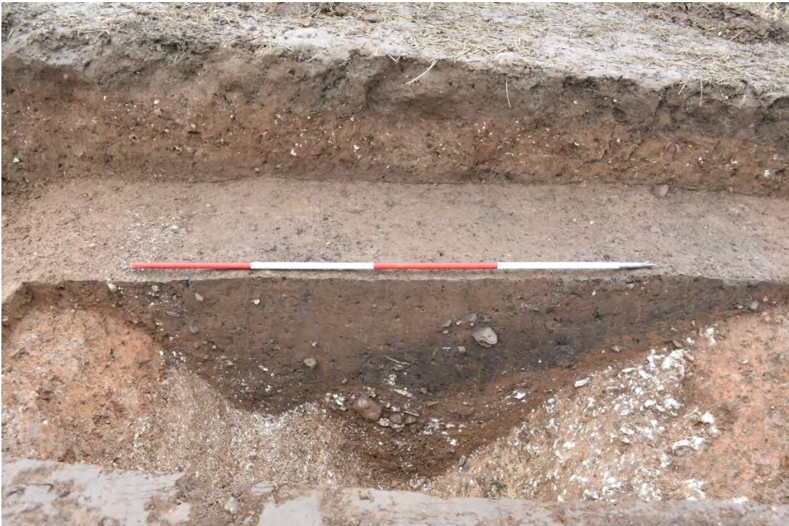
Plate 2.40: Trench 86. East facing section of trackway ditch Group DBS3/2, looking west.