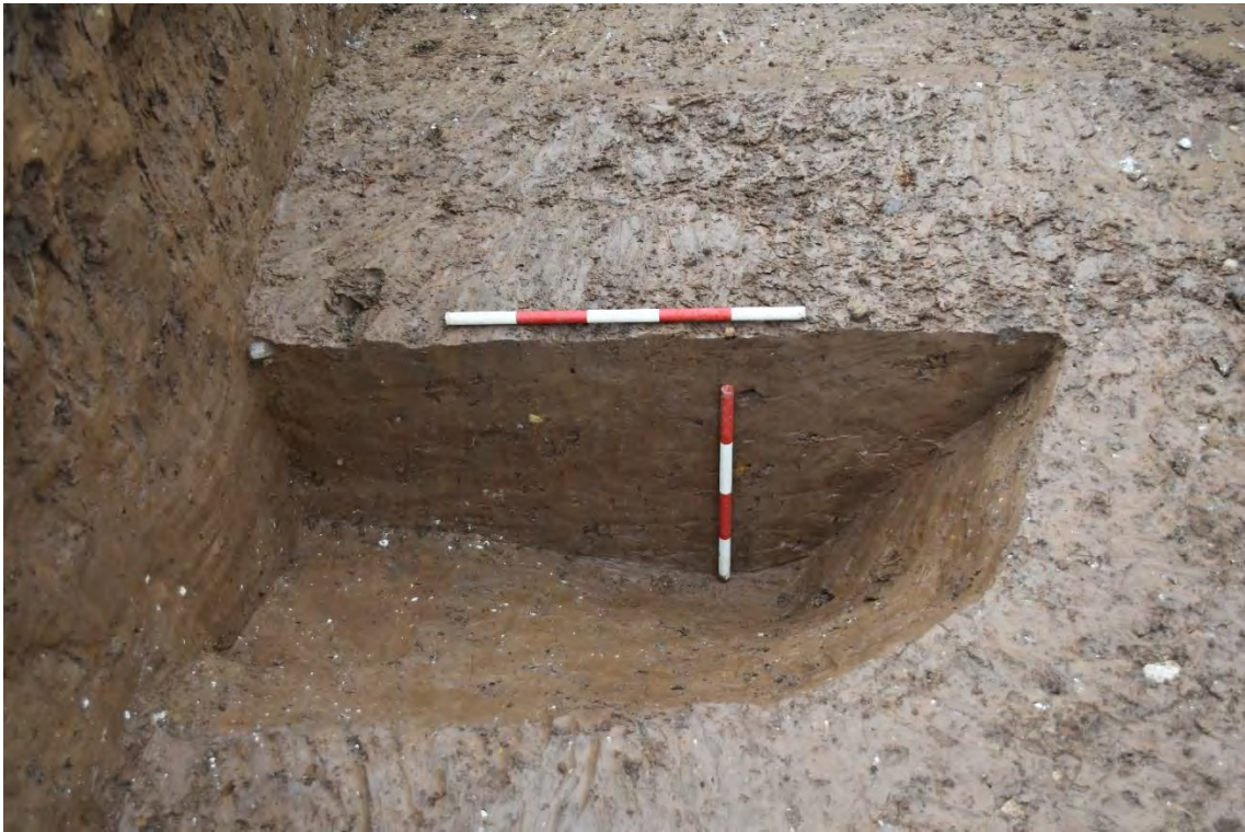
Plate 2.77: Trench 91. East facing section of ditch terminus [9102] (Group DBS3/9), looking west.