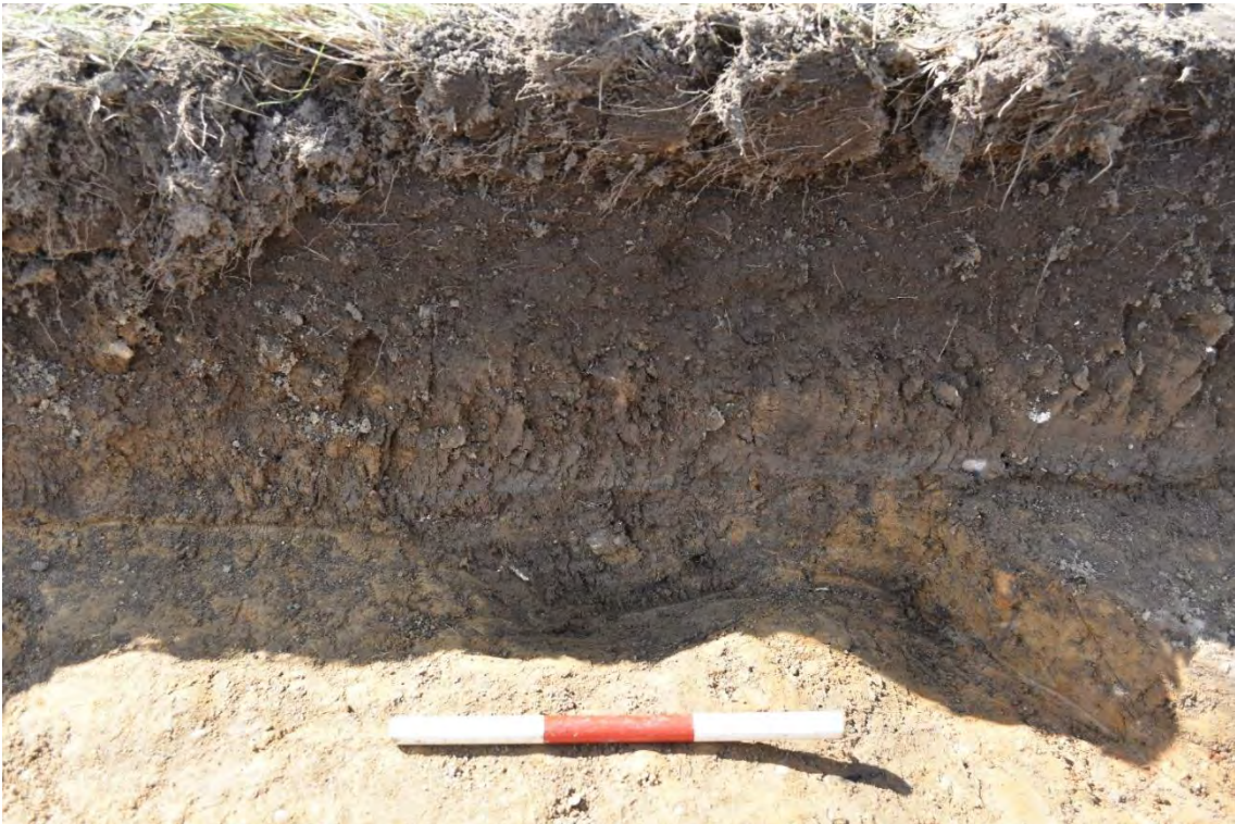
Plate 2.12: Trench 60, Section of pit [6005], looking southwest.