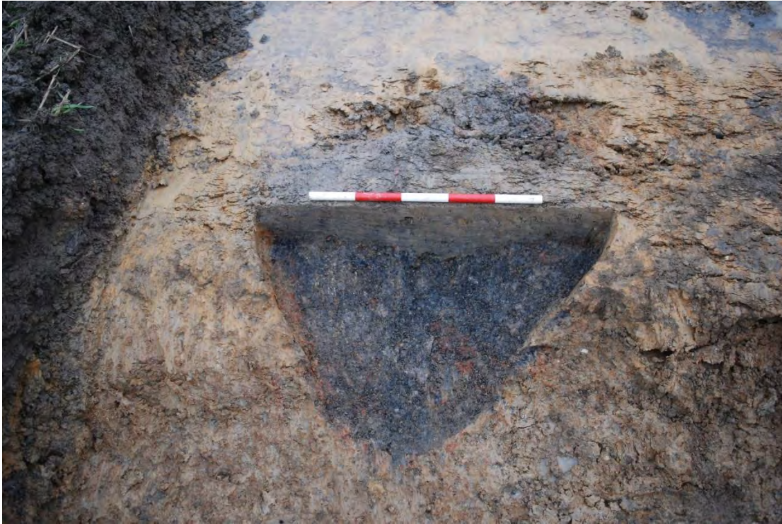
Plate 2.85: Trench 115. Mid-excavation plan view of pit [11504], looking southeast.