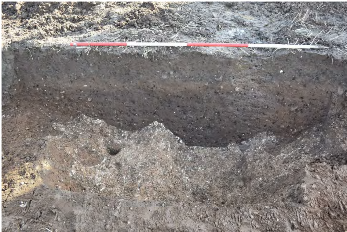
Plate 2.70: Trench 85. North facing section of ditch [8505] and recut [8503] (Group DBS3/4), looking south.