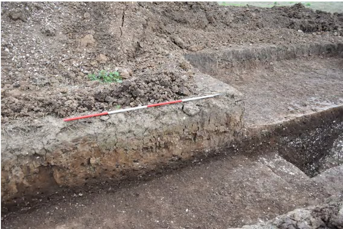
Plate 2.60: Trench 88. West facing section of colluvial deposit (8824) and ditch [8809], looking southeast.