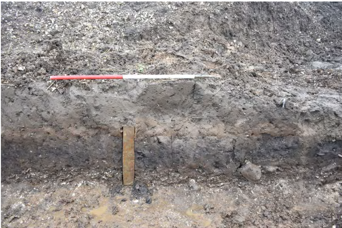
Plate 2.54: Trench 89. West facing section of Monolith sample {DBS3/57}, looking east.