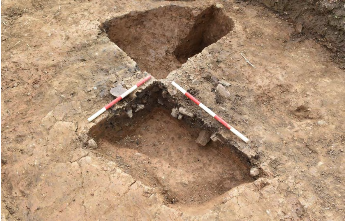
Plate 2.75: Trench 90. Plan view of pit [9004], looking south.