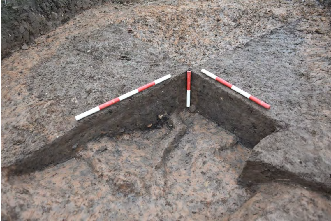
Plate 2.47: Trench 86. Earlier large pit [8624] truncated by pits [8628] and [8630], looking southeast.