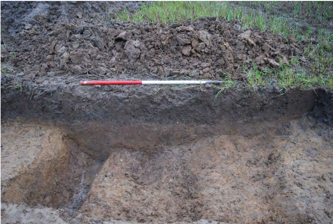
Plate 2.84: Trench 112. Southeast facing section of ditch [11202] and [11205], looking northwest.