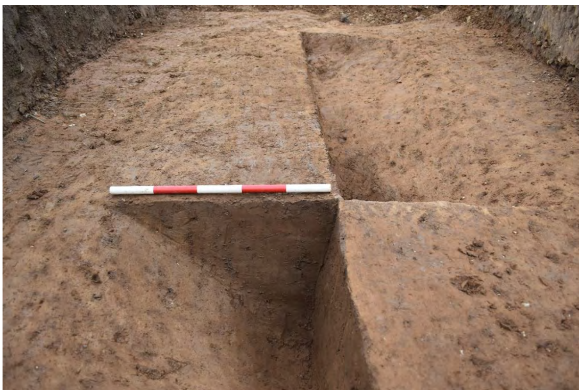
Plate 2.74: Trench 84. Northeast facing section of [8410], looking southwest.