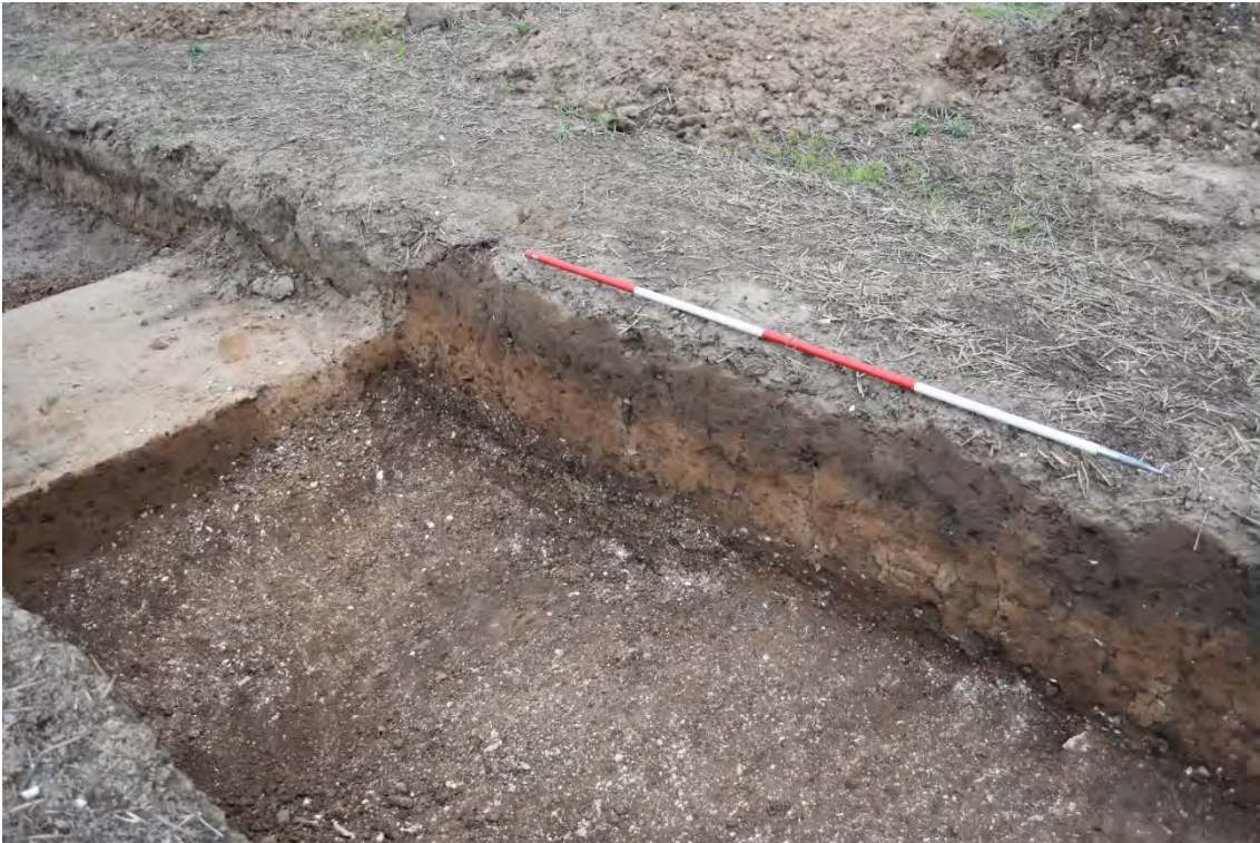
Plate 2.56: Trench 87 West facing section of colluvial deposit (8742) (Group DBS3/8), looking northwest.