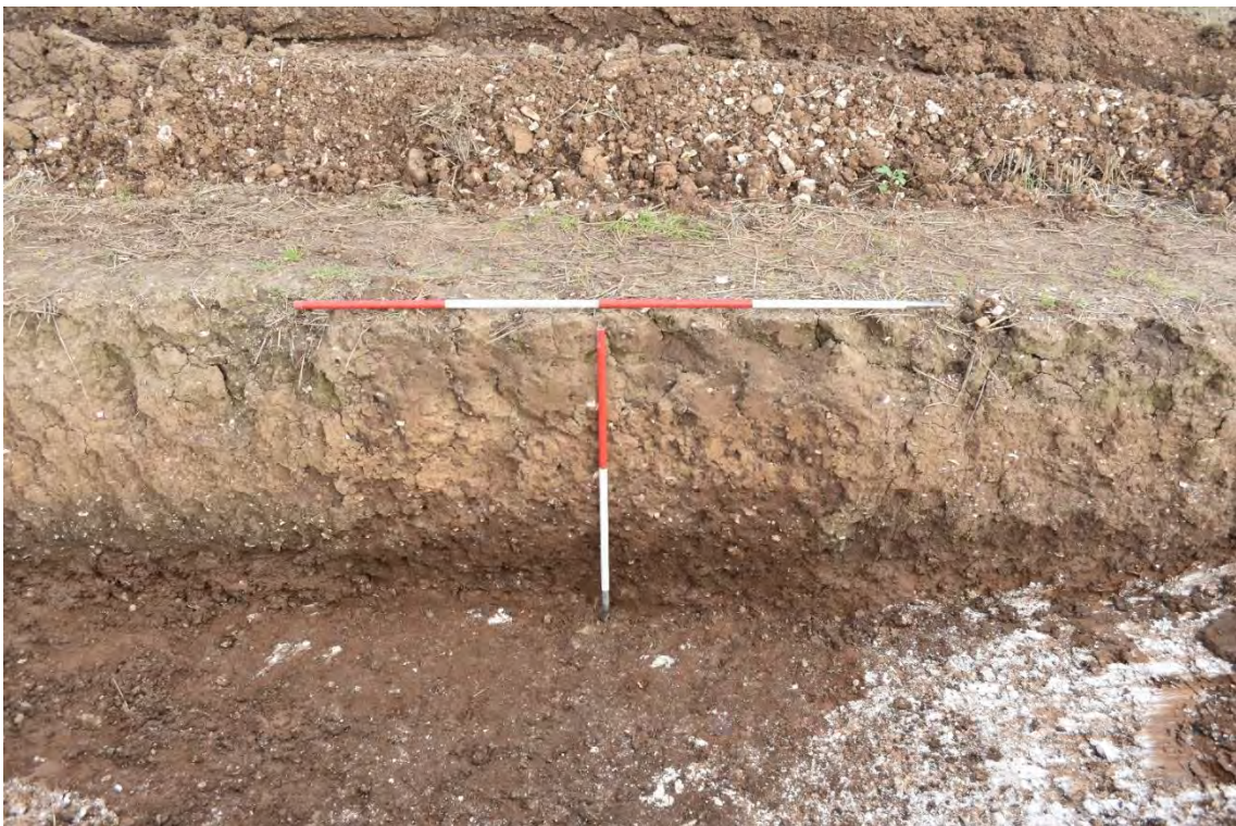
Plate 2.64: Trench 89. West facing section of overburden deposits at south end of trench, looking east.