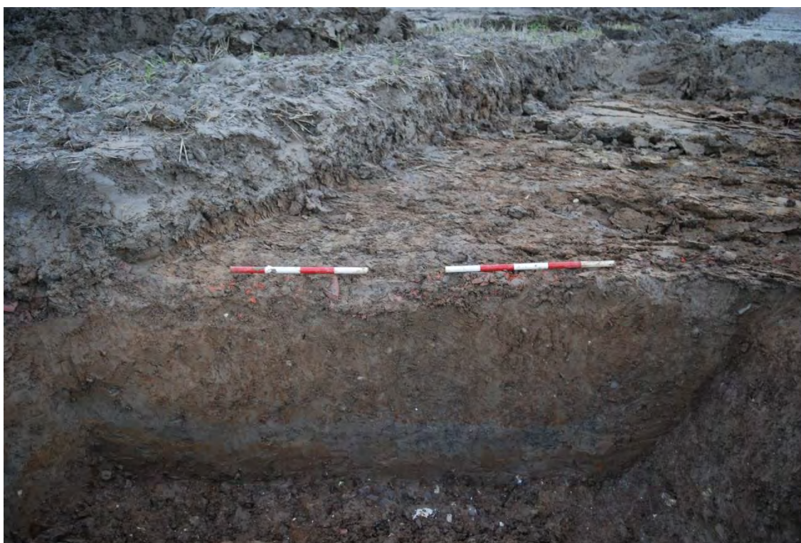
Plate 2.88: Trench 117. Southeast facing section of ditch [11704], looking northwest.