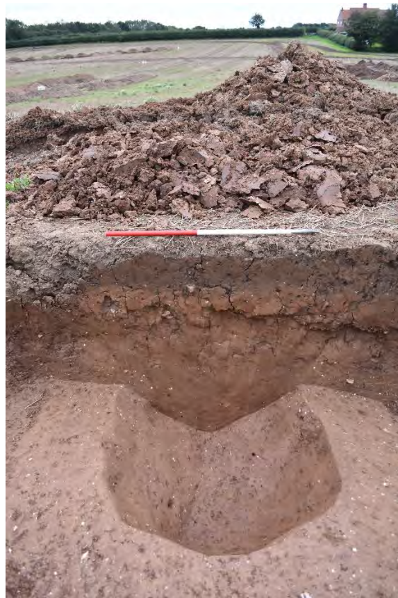
Plate 2.78: Trench 91. North facing section of 100 % excavated ditch terminus [9102] (Group DBS3/9), looking south.