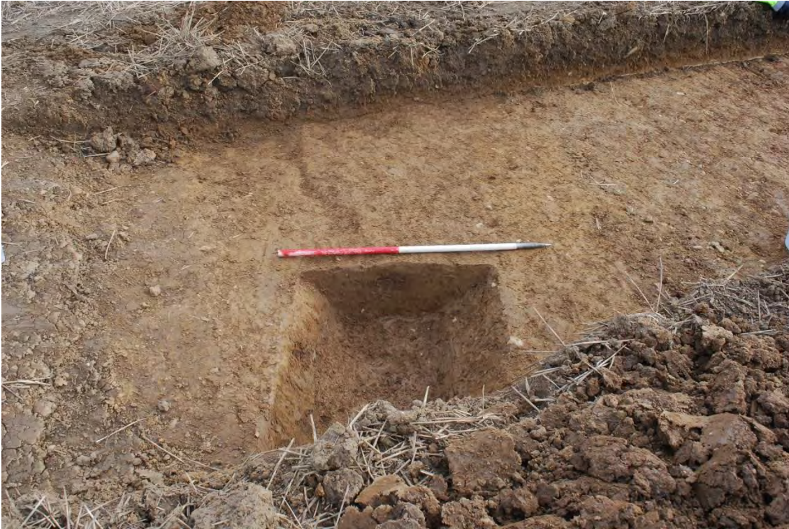
Plate 2.81: Trench 110. Northwest facing section of ditch [11007], looking southeast.