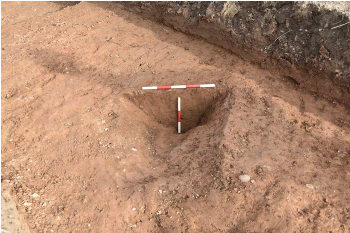
Plate 2.72: Trench 84. West facing section of terminus [8412], looking east.