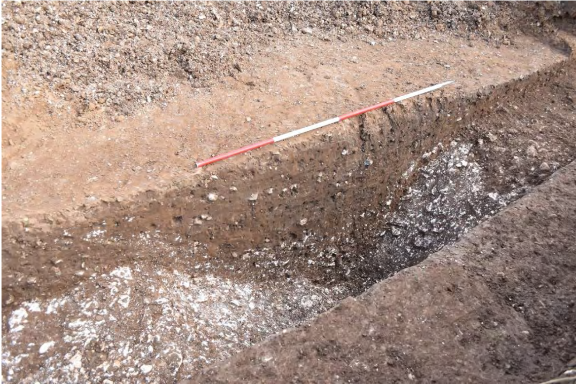
Plate 2.43: Trench 89. West facing section of trackway ditch Group DBS3/3, looking southeast.