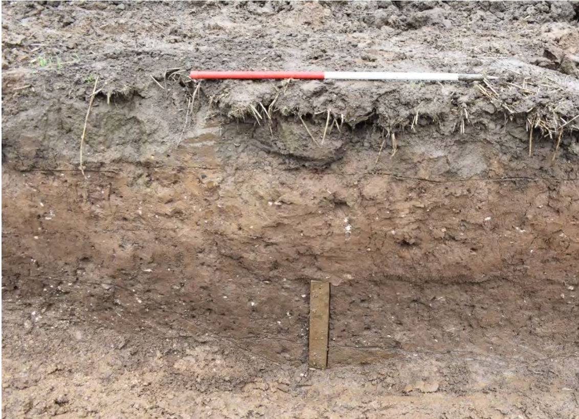
Plate 2.55: Trench 86. West facing section of Monolith sample {DBS3/63}, looking east.