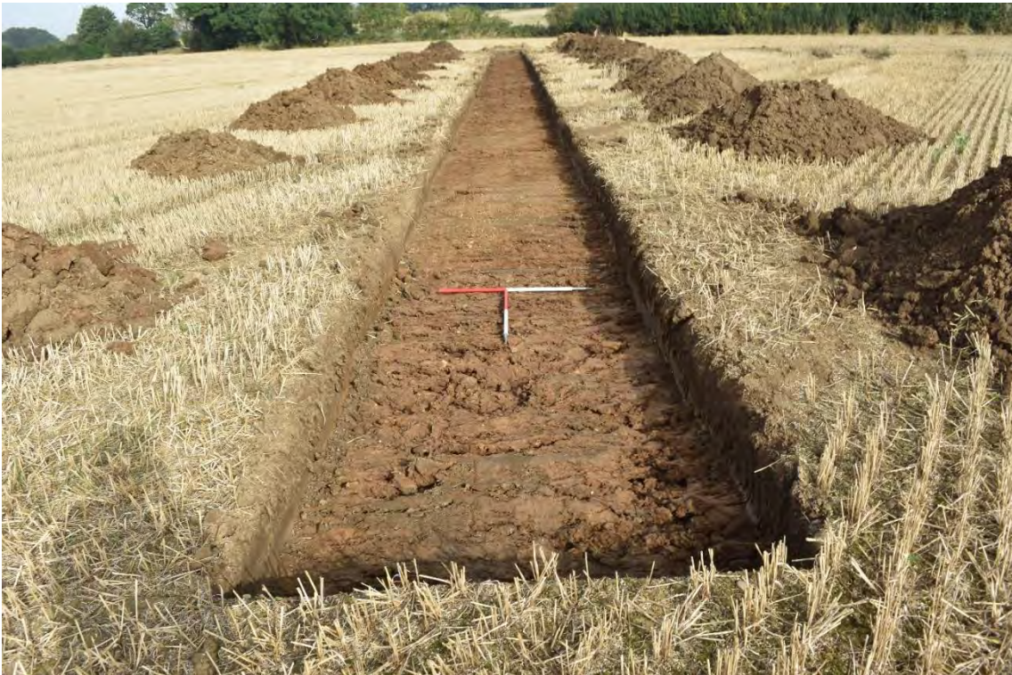
Plate 2.10: Trench 73. Trench shot showing furrows in plan, looking north-northwest.