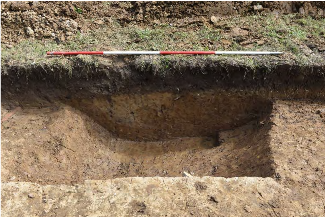
Plate 2.18: Trench 66. Section of ditch [6605] and furrow [6620], looking southeast.