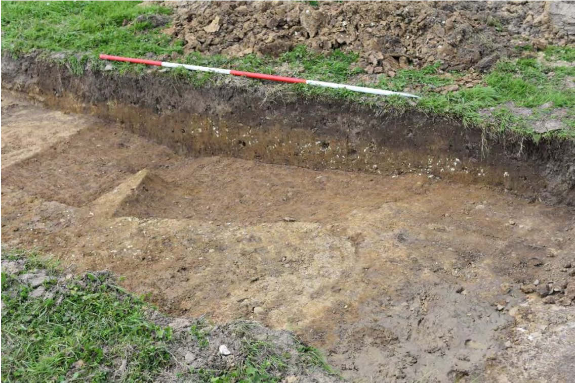
Plate 2.9: Trench 65. Excavated slot through furrow [6501]. Looking west.