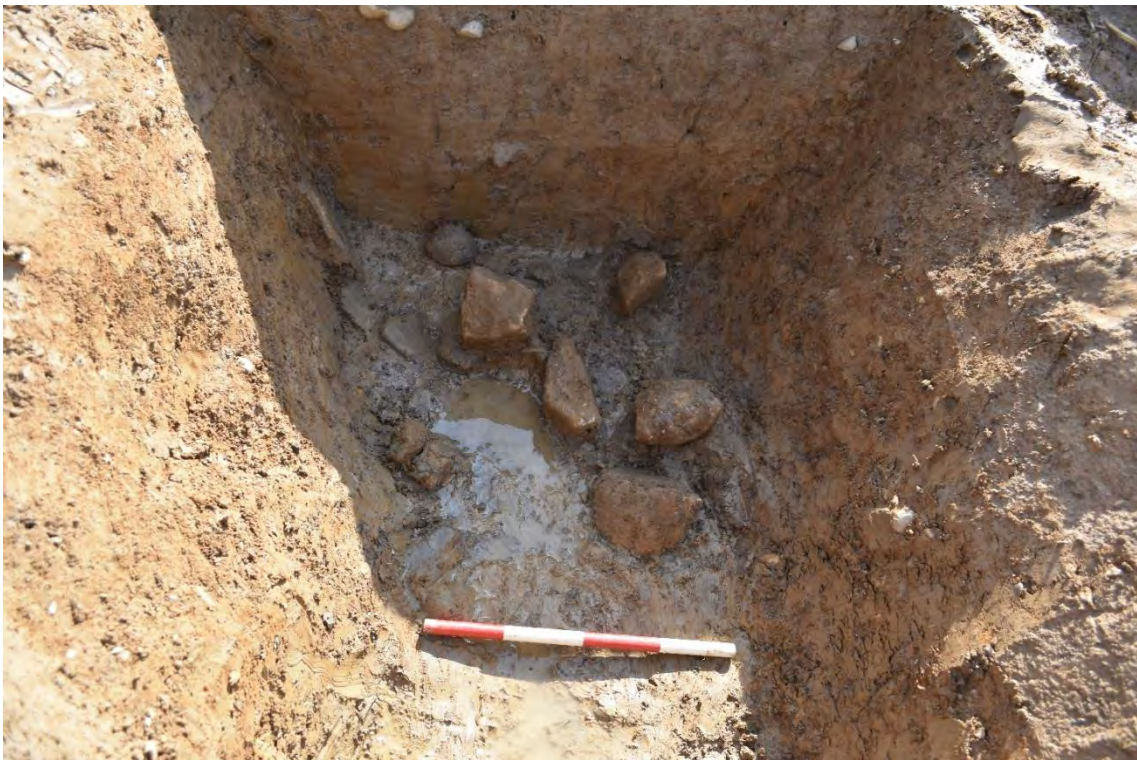
Plate 2.22: Trench 75. Mid-excavation view of ditch [7502], showing stones in fill (7505), looking south.