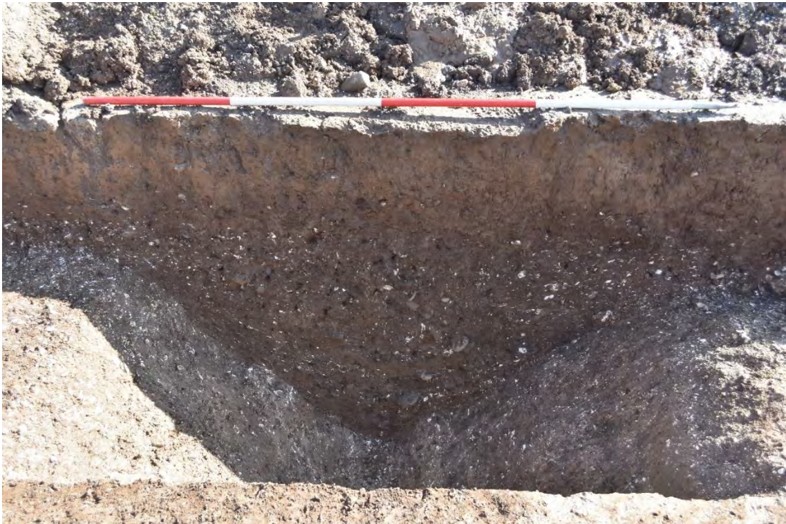
Plate 2.36: Trench 87. West facing section of ditch [8704] (Group DBS3/1), looking east.