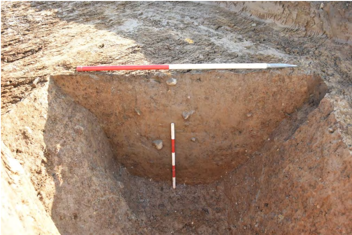
Plate 2.21: Trench 75. North-facing section of ditch [7503] and recuts [7502], [7504]. Looking south.