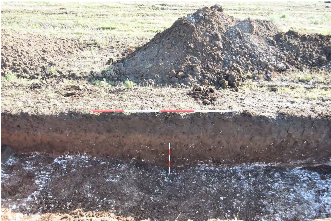
Plate 2.58: Trench 87. West facing section of deposit (8743) (Group DBS3/8) towards north end, looking east.