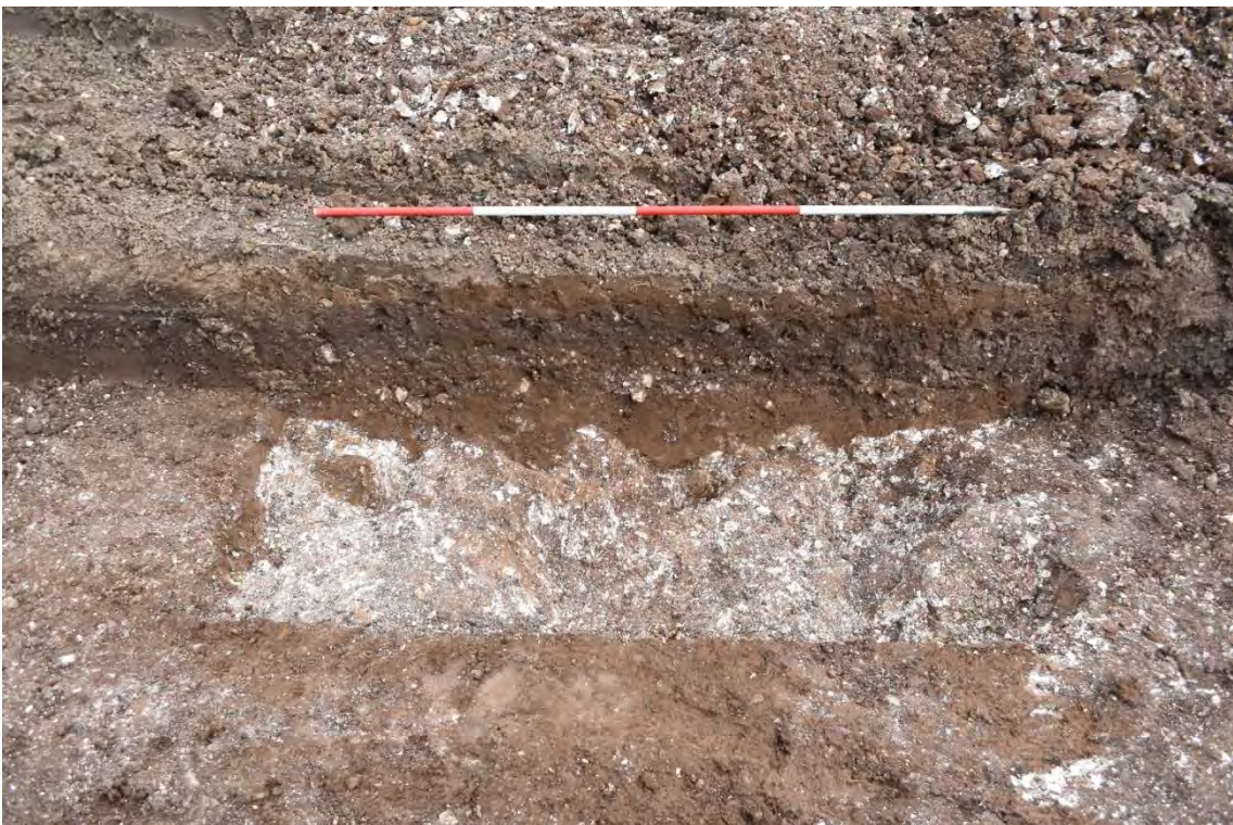
Plate 2.62: Trench 88. Section sequence of natural deposits (8840), (8823) (Group DBS3/7), and colluvial deposit (8824) (Group DBS3/8). Located at south end of trench, looking east.