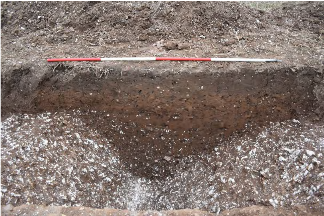
Plate 2.34: Trench 82. East facing section of [8205] (Group DBS3/1), looking west.