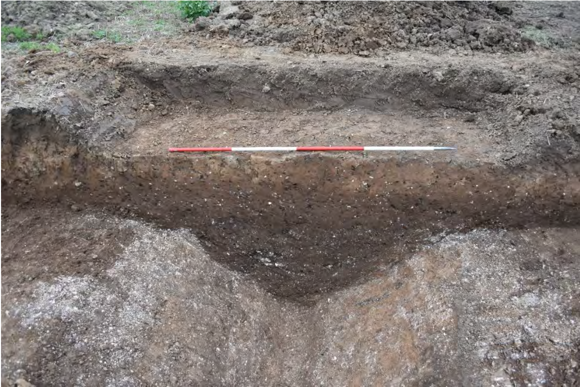
Plate 2.39: Trench 88. East facing section of trackway ditch Group DBS3/1, looking west.