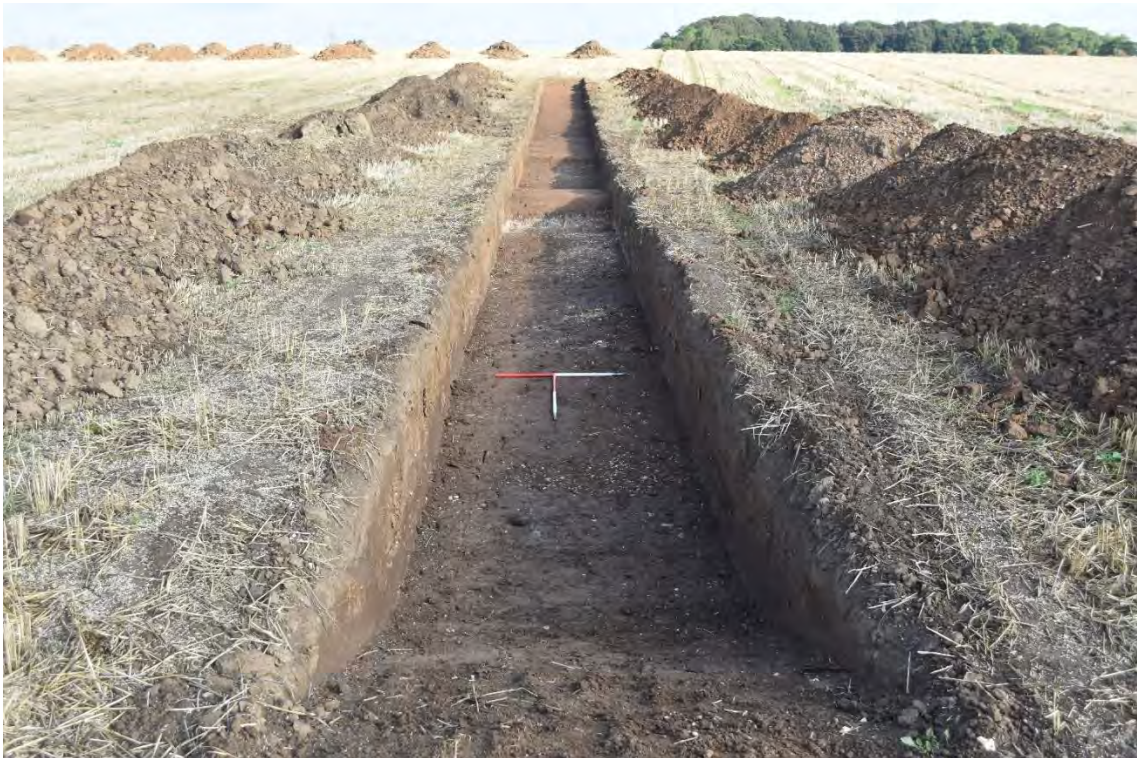
Plate 2.28: Trench 87. Pre-excitation trench shot, looking north.