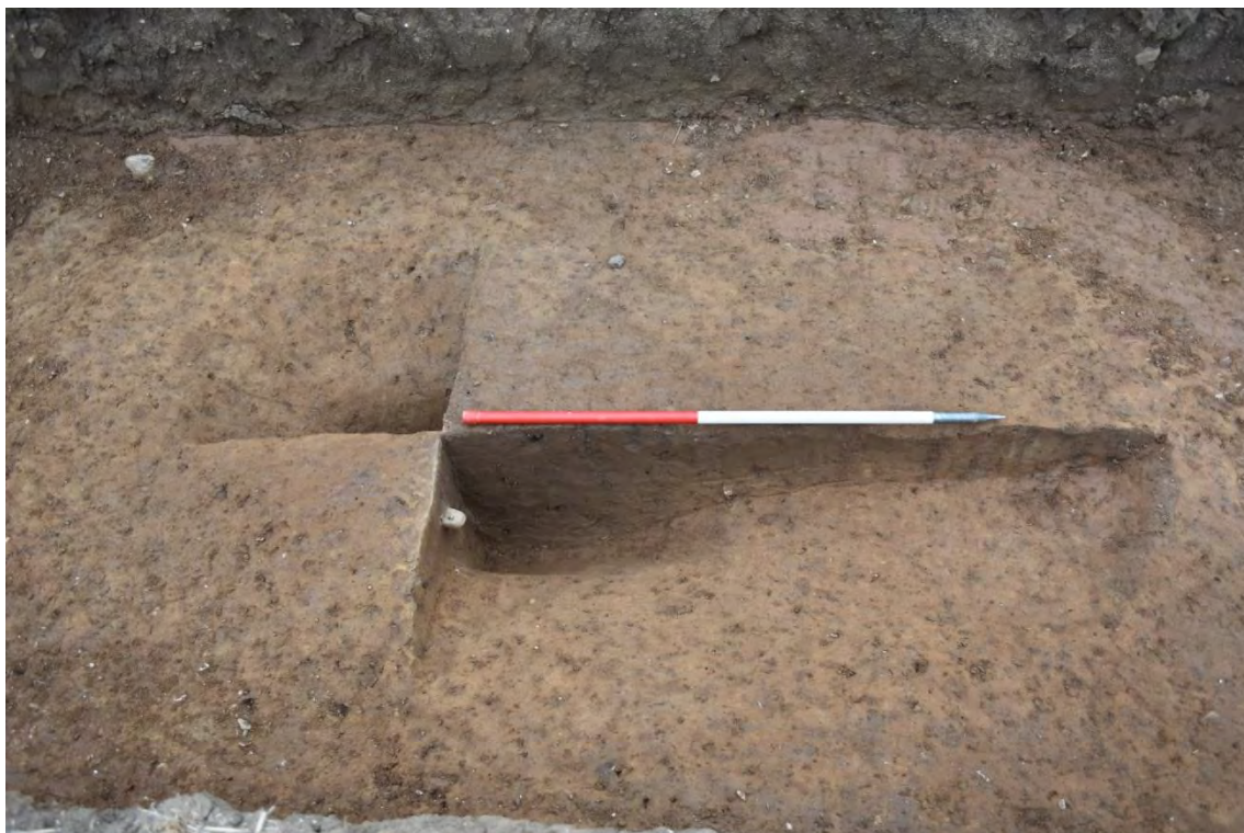
Plate 2.73: Trench 84. Northwest facing section of pit [8410], looking southeast.