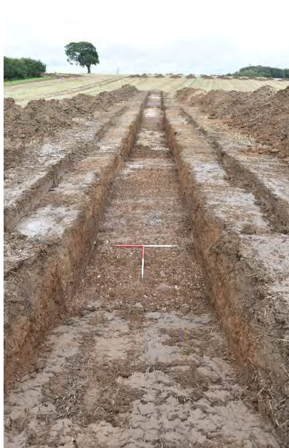
Plate 2.32: Trench 86. Pre-excavation trench shot, showing depth of overburden deposits. Looking north.