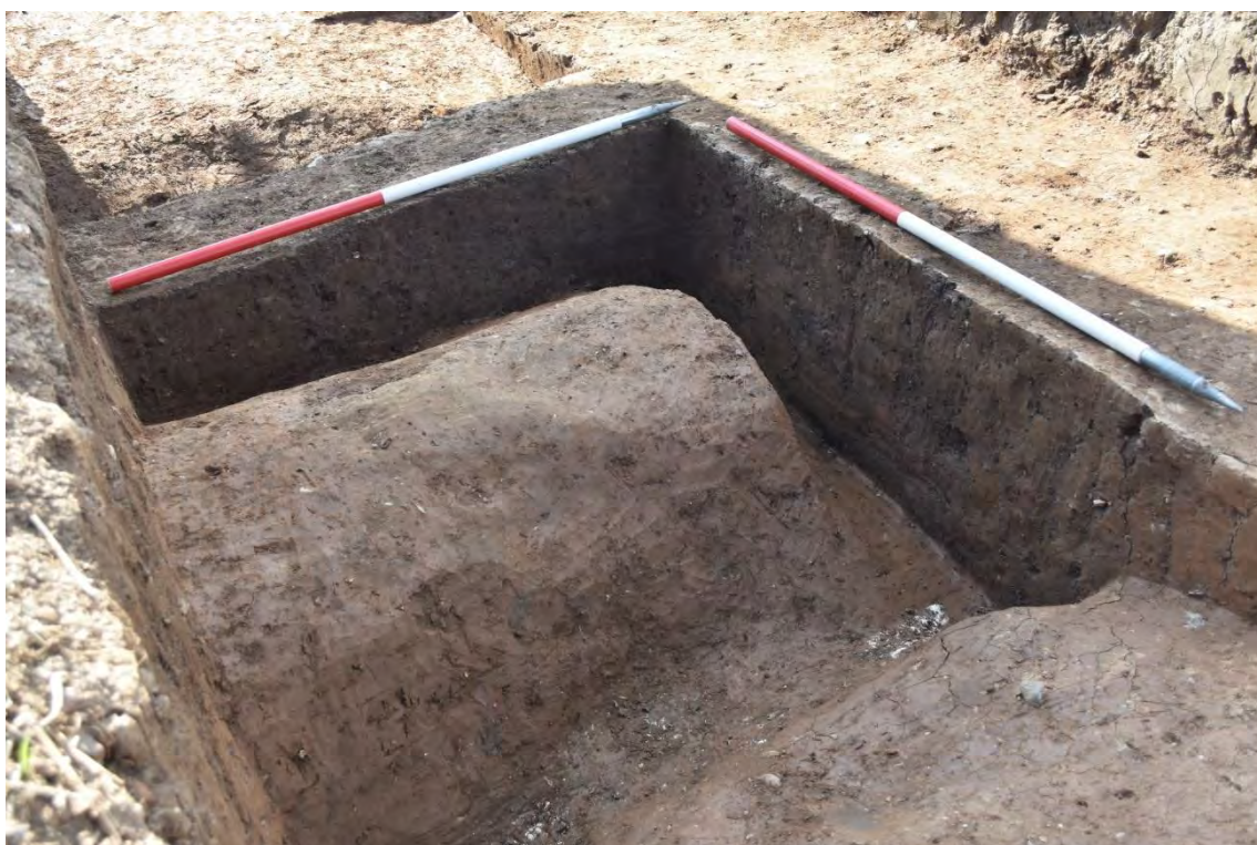
Plate 2.52: Trench 87. Relationship slot between pits [8706], [8708], [8707], [8744], and ditch [8705]. Looking southwest.