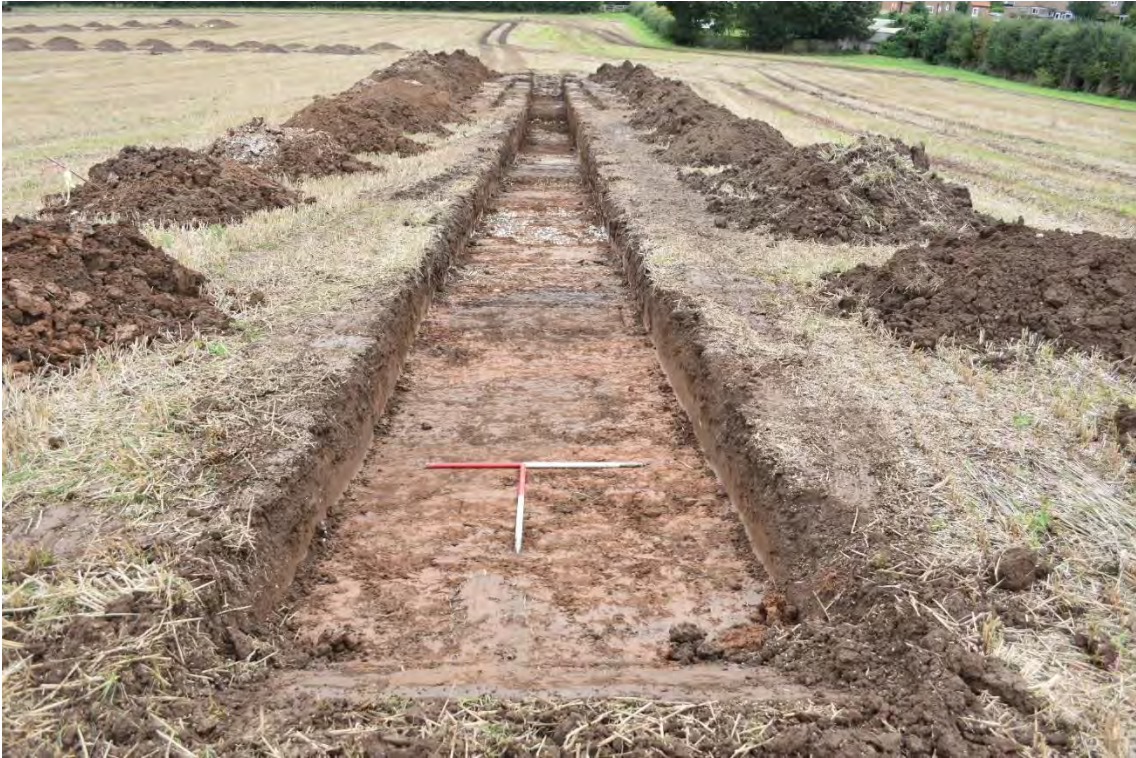
Plate 2.33: Trench 86. Pre-excavation trench shot showing pits in foreground, looking south.