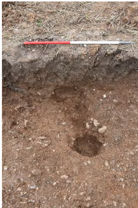
Plate 2.68: Trench 83. Plan view of gully [8307] and pit [8305], looking southwest.