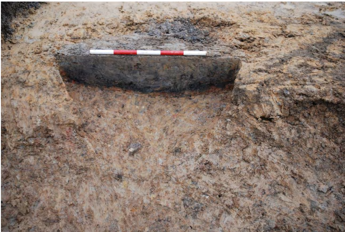
Plate 2.86: Trench 115. Northwest facing section of 50% excavated pit [11504], looking southeast.