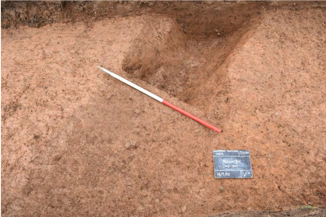
Plate 2.71: Trench 84. Plan view of ditch [8403] and recut [8405] (Group DBS3/4), looking southeast.