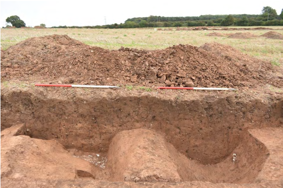
Plate 2.50: Trench 87. West facing section of intercutting features [8705], [8706], [8708], and [8740] looking east.