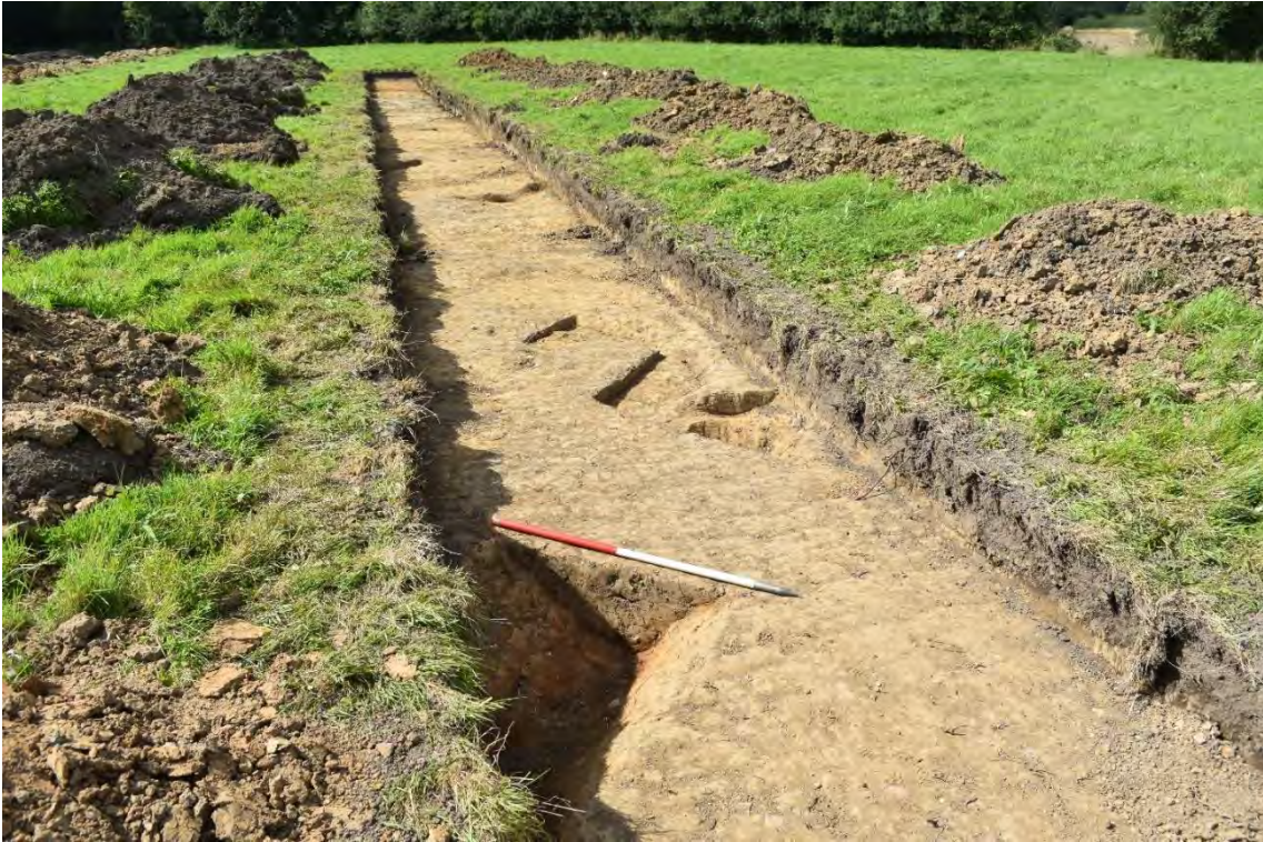
Plate 2.13: Trench 60. Plan view of ditch [6013]=[6007] and furrow [6009], looking northwest.