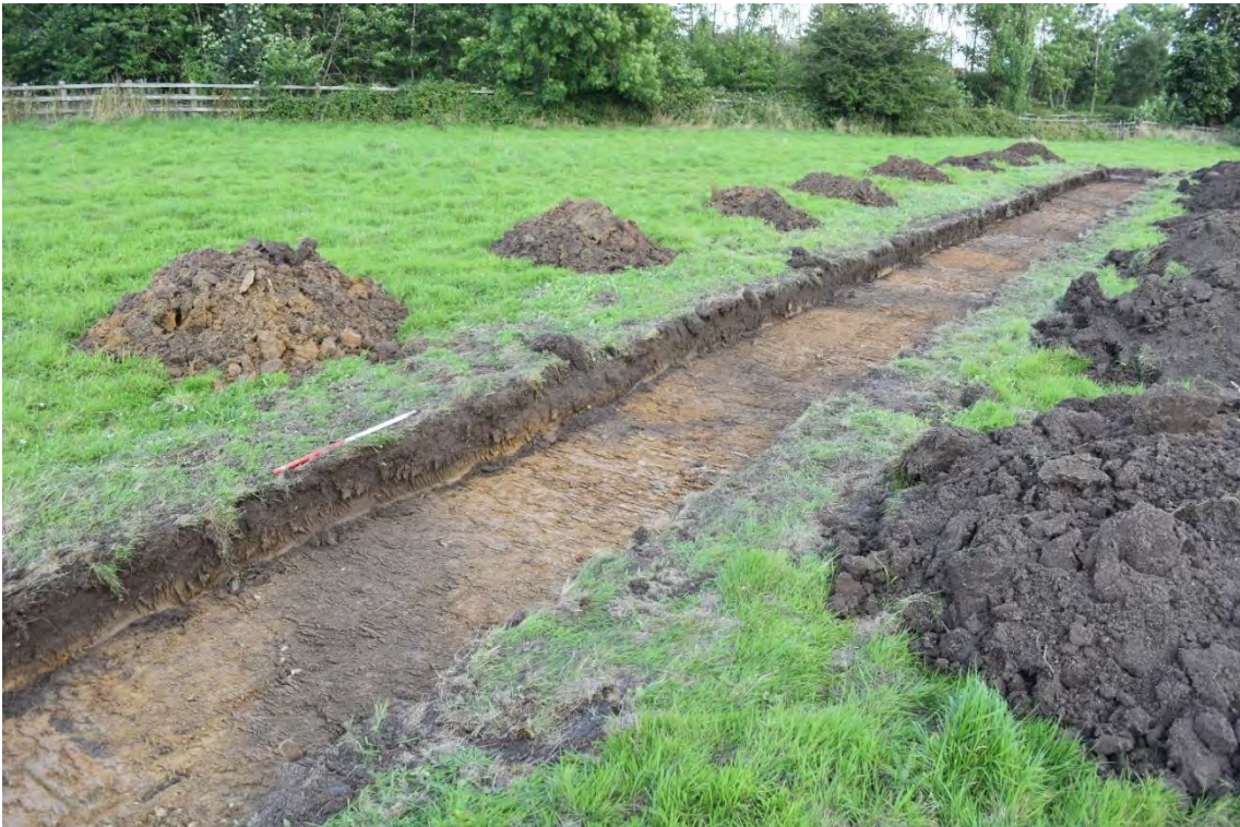
Plate 2.14: Trench 60. Pre-excitation plan view of furrows, looking east.