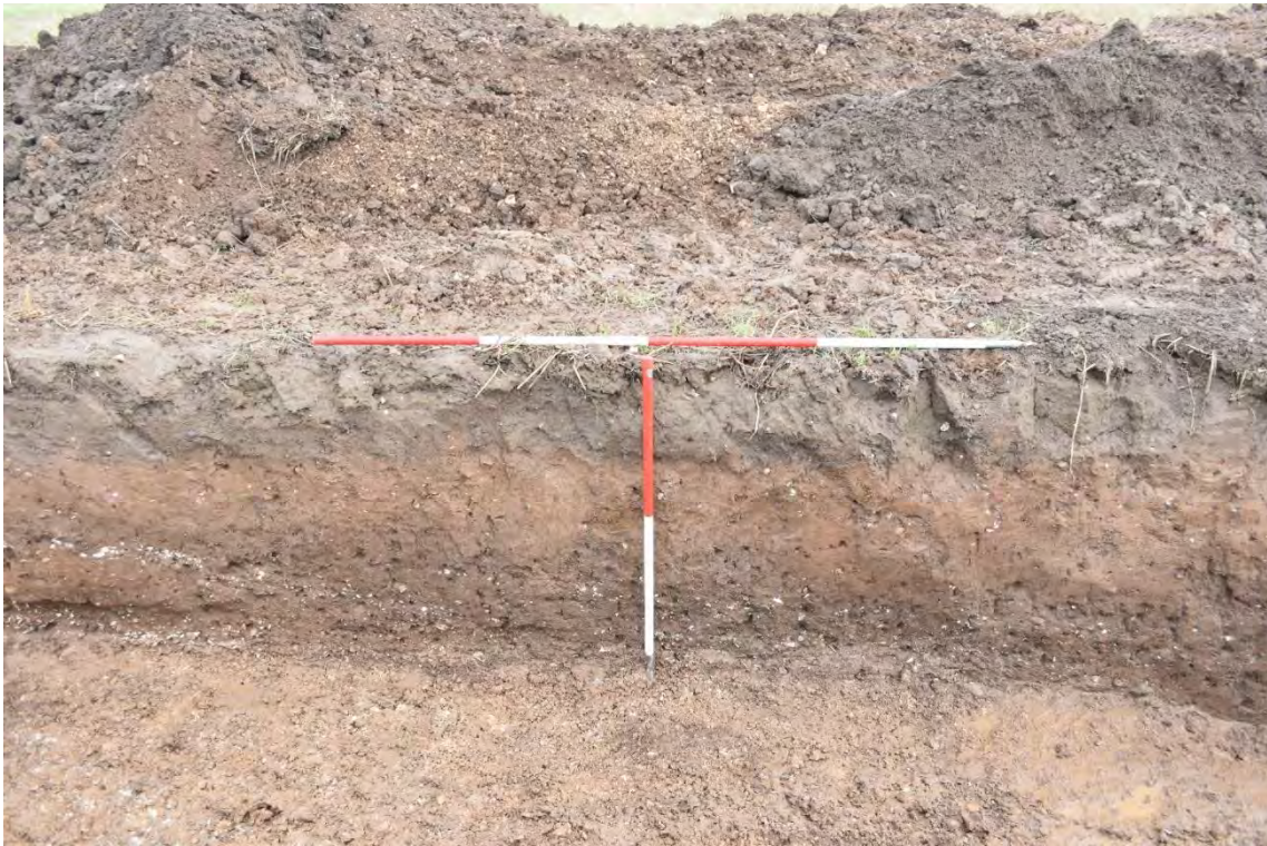
Plate 2.65: Trench 86. West facing section of deposit sequence, towards north end, looking east.