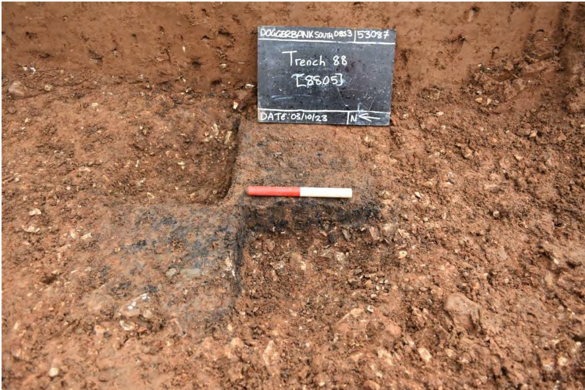
Plate 2.53: Trench 88. West facing section of pit [8805], looking east.