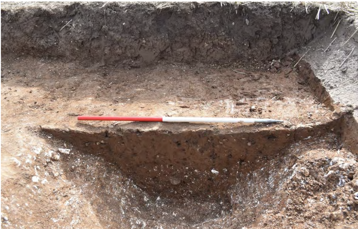
Plate 2.24: Trench 81. North facing section of ditch [8107] and recut [8105] (Group DBS3/5), looking south.