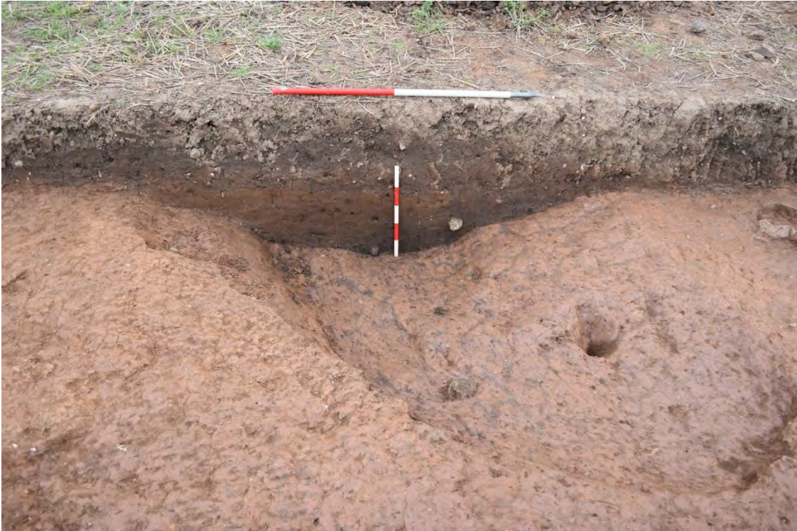
Plate 2.49: Trench 86. West facing section of 100% excavated pits [8618], [8619], and [8620], looking east.