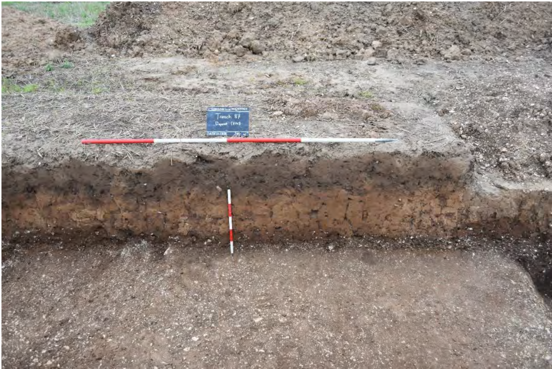
Plate 2.57: Trench 87. West facing section of colluvial deposit (8742) (Group DBS3/8), looking east.