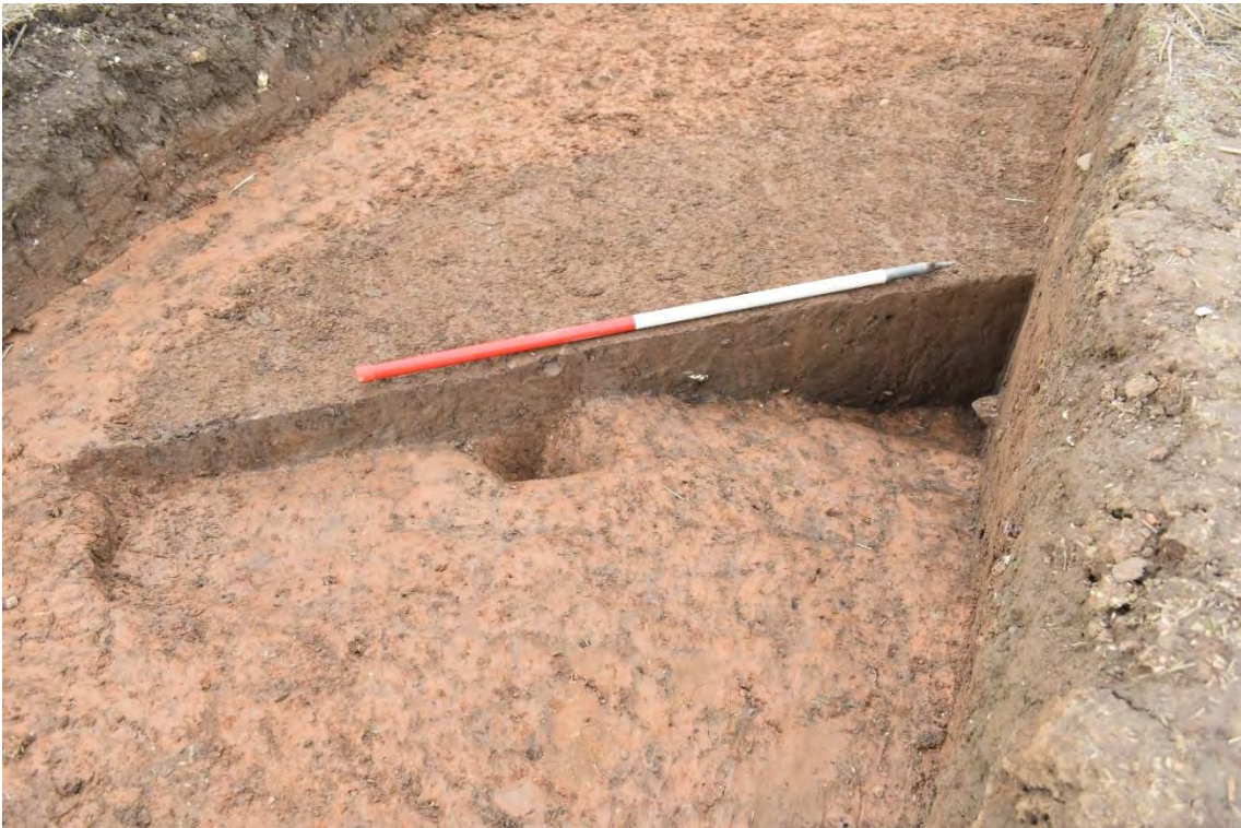
Plate 2.48: Trench 86. Southeast facing section of pits [8618], [8619] and [8620], looking northwest.