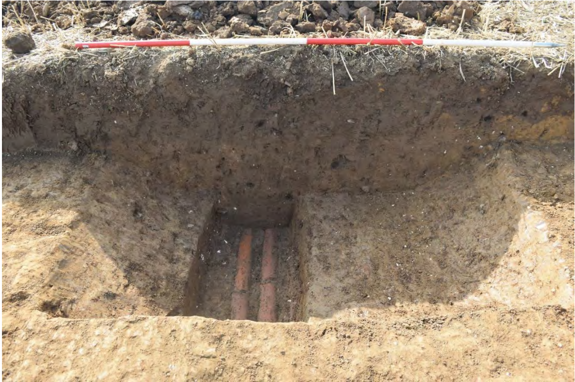
Plate 2.23: Trench 77. North facing section of ditch [7702], looking south.