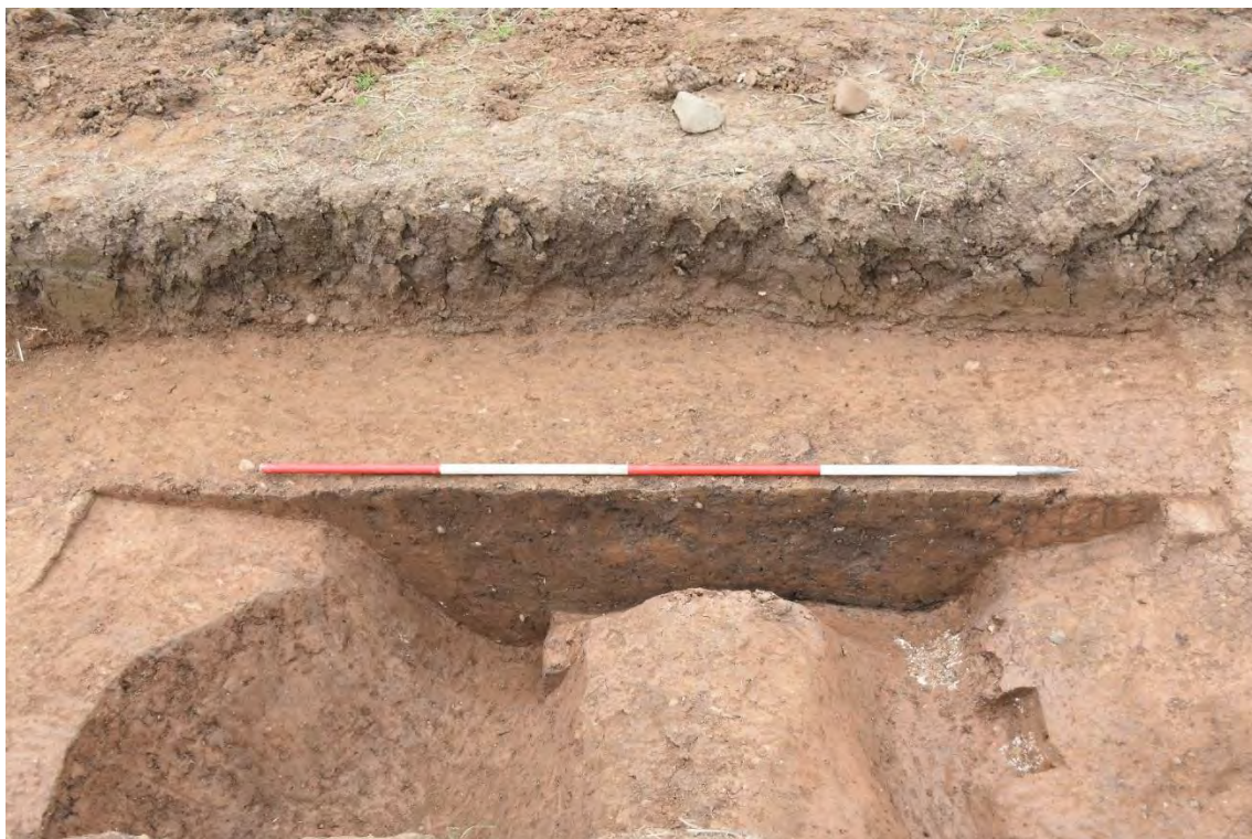
Plate 2.51: Trench 87. East facing section of pits [8708] and [8744] cut by pit [8707], looking west.