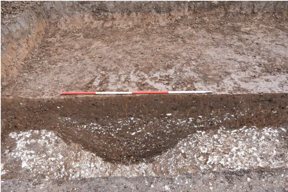
Plate 2.44: Trench 88. West facing section of trackway ditch Group DBS3/3, looking east.