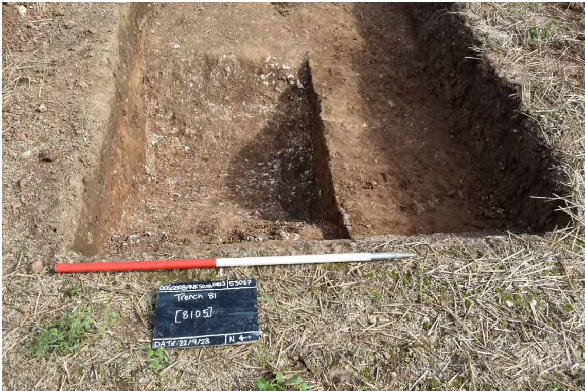
Plate 2.25: Trench 81. Plan view of ditch [8107] and recut [8105] (Group DBS3/5), looking east.