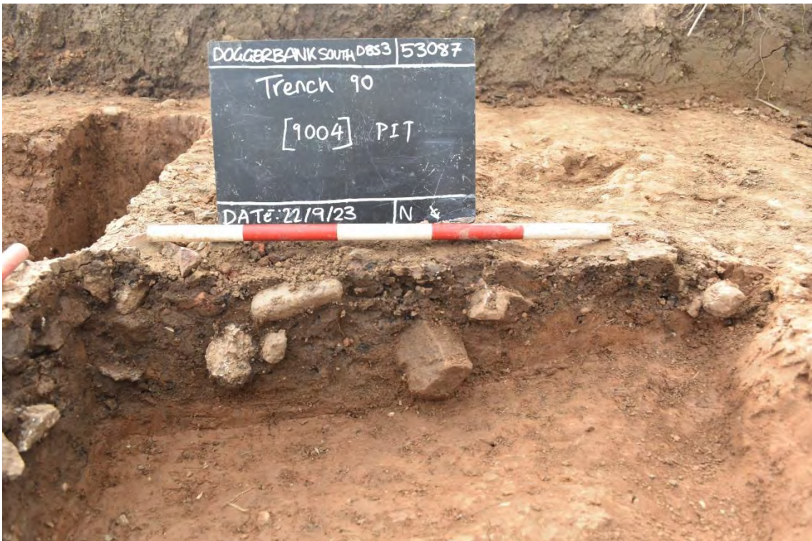
Plate 2.76: Trench 90. Northeast facing section of pit [9004], looking southwest.