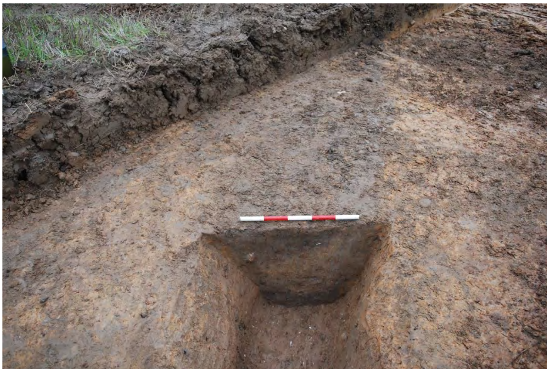
Plate 2.91: Trench 118. North facing section of ditch [11803], looking south.