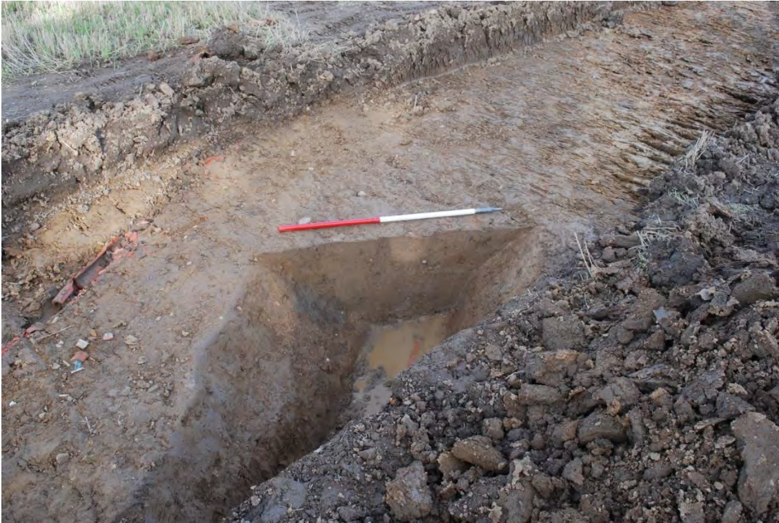
Plate 2.83: Trench 111. Southeast facing section of ditch [11107] (Group DBS4/1), looking north.