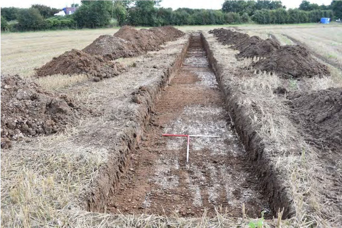
Plate 2.29: Trench 82. Pre-excitation trench shot. Chalk natural with ditch Group DBS3/1 in foreground. Looking south.