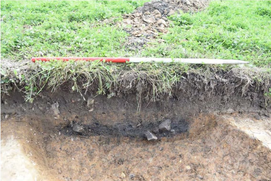
Plate 2.17: Trench 66. Pit [6603] after full excavation, looking southeast.