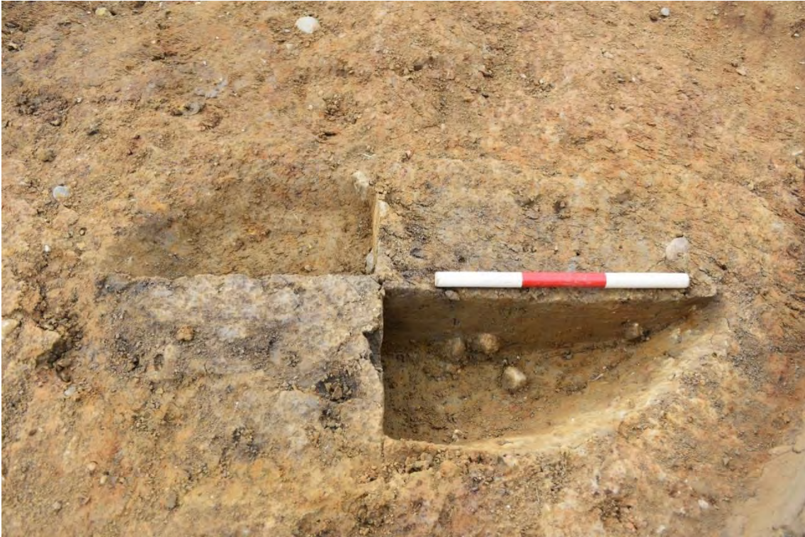
Plate 2.19: Trench 74. Plan view of pit [7402], looking southwest.