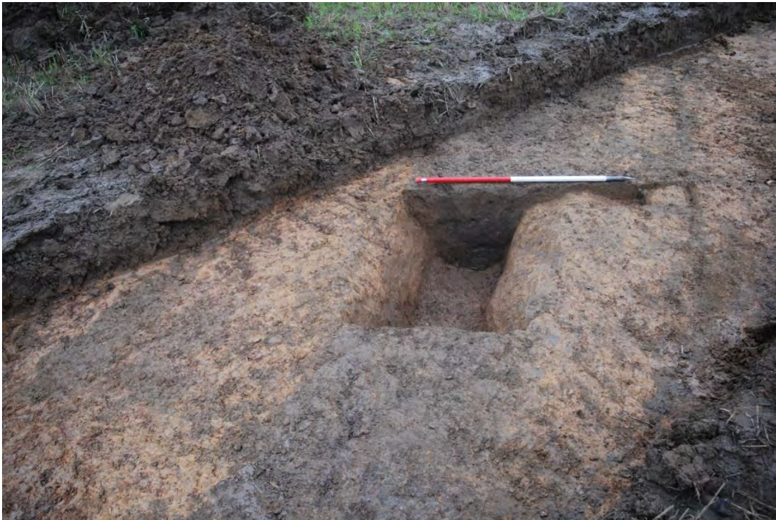
Plate 2.90: Trench 118. South facing section of ditch [11803], looking north.