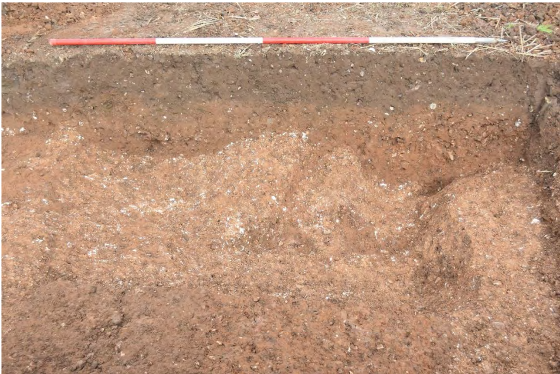
Plate 2.26: Trench 81. Southeast facing section of irregular linear feature [8110] (right) and furrow [8109], looking northwest.