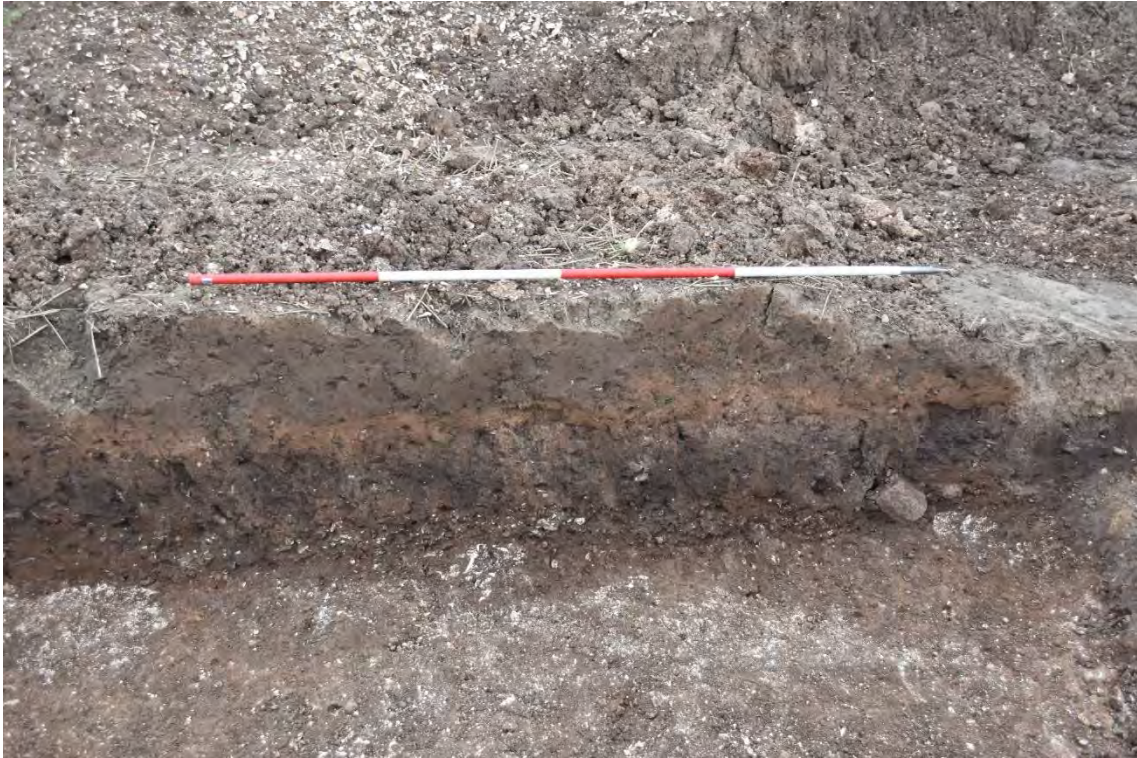
Plate 2.63: Trench 89. West facing section of natural gravel deposit (8938) (Group DBS3/7) overlain by colluvial deposit (8939) (Group DBS3/8), looking east.