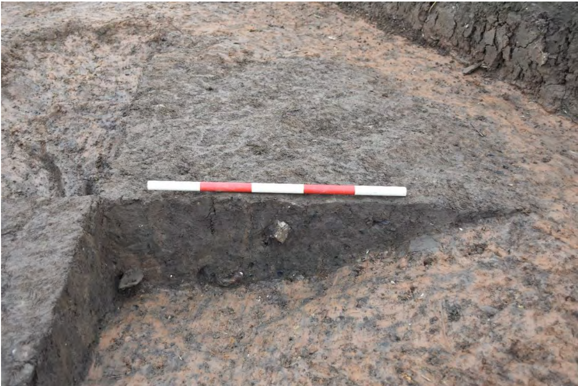
Plate 2.46: Trench 86. South facing section of pit [8624], with iron object DBS3/RF4 in-situ, looking north.