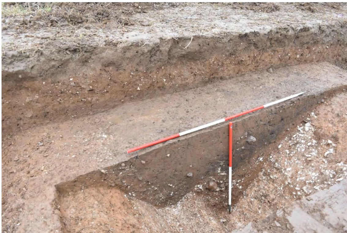
Plate 2.41: Trench 86. Oblique view of trackway ditch Group DBS3/2, looking southeast.