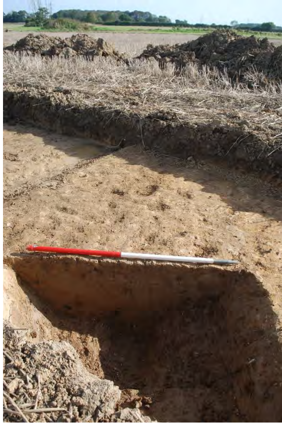
Plate 2.79: Trench 109. Southwest facing section of ditch [10903], looking northeast.