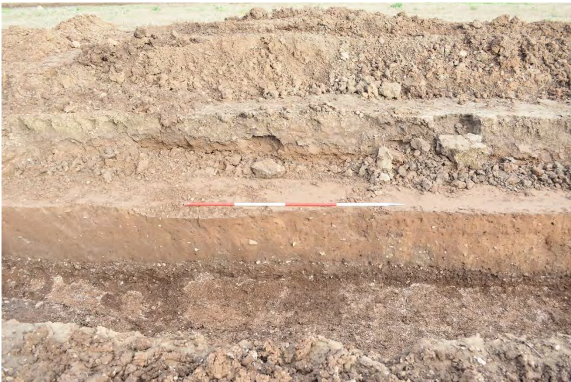
Plate 2.66: Trench 86. West facing section of natural gravel deposit (8603) (Group DBS3/7) overlain by colluvial deposit (8602) (Group DBS3/8), looking east.