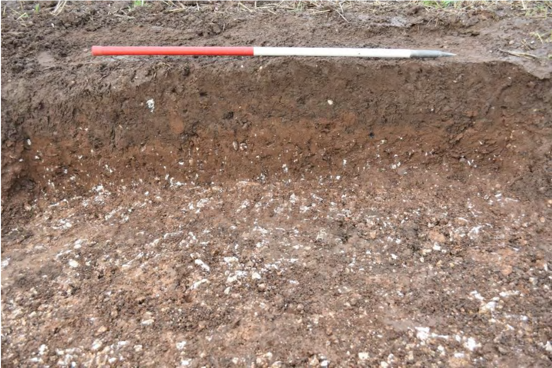
Plate 2.61: Trench 88. East facing section of colluvial deposit (8803) (Group DBS3/8) north end of trench. Looking west.