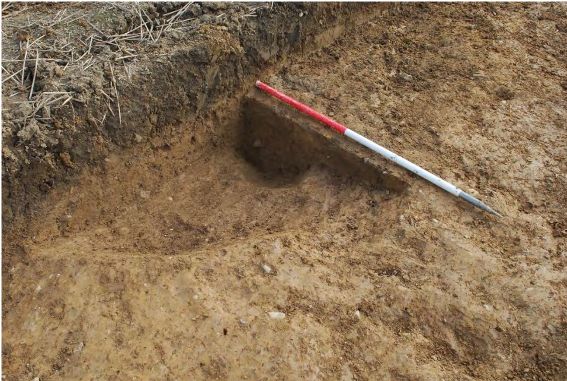
Plate 2.80: Trench 110. Section of pit [11005], looking south.