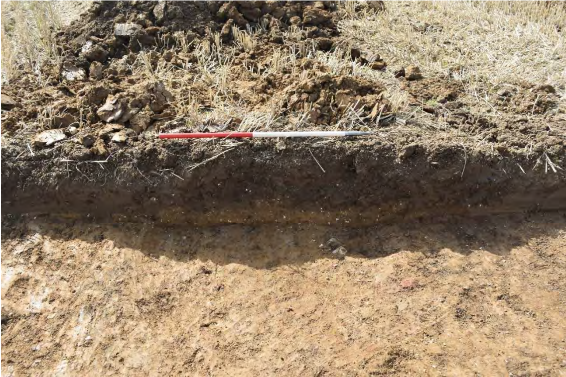
Plate 2.11: Trench 76. Section of furrow [7602], looking southwest.