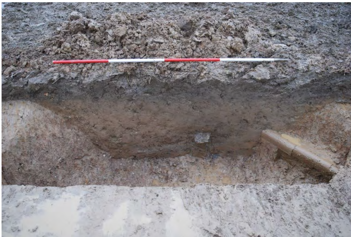
Plate 2.87: Trench 117. Southwest facing section of ditch [11704], looking northeast.