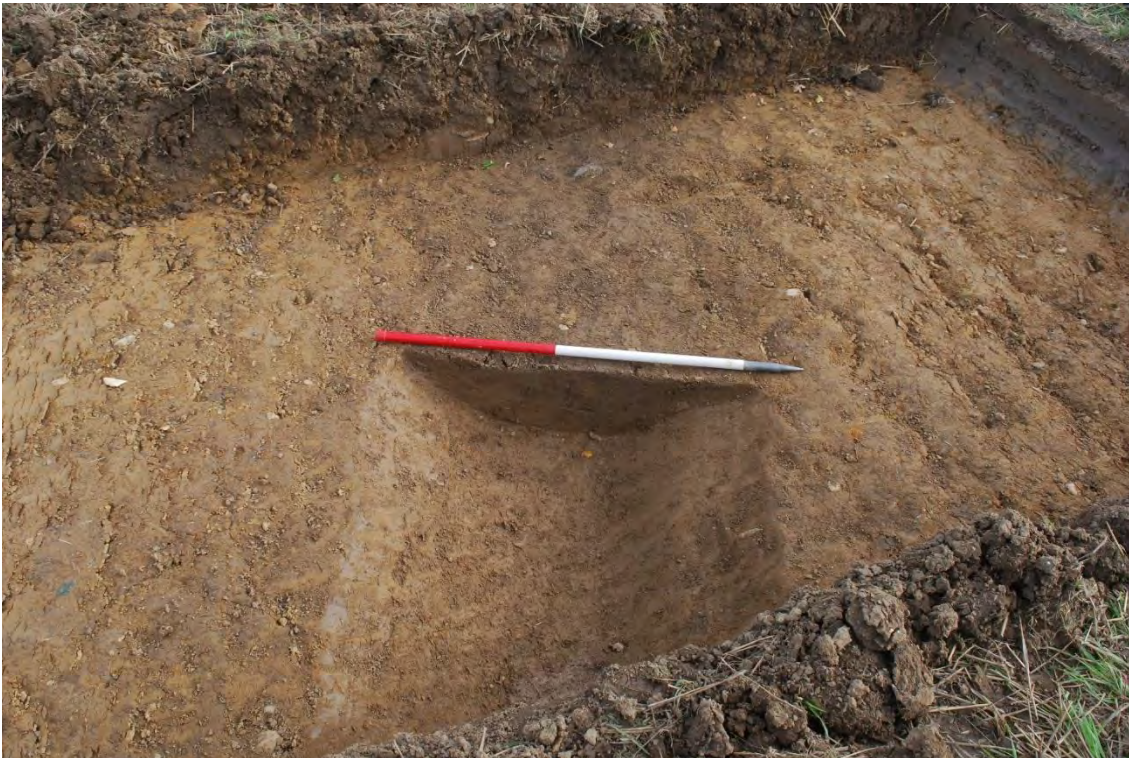
Plate 2.82: Trench 111. Southwest facing section of ditch [11103], looking northeast.