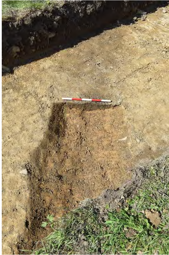
Plate 2.15: Trench 60. Furrow [6019], looking west.