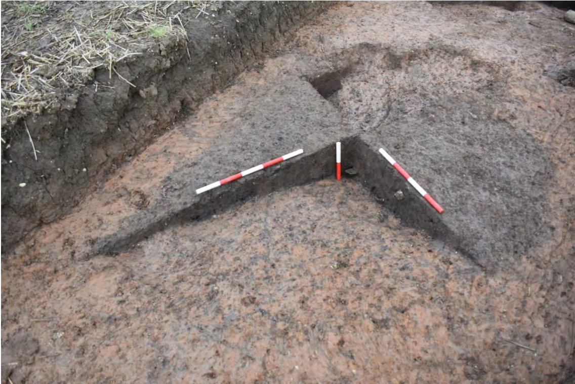
Plate 2.45: Trench 86. Sections of pit [8624] truncated by pit [8626], looking northwest.