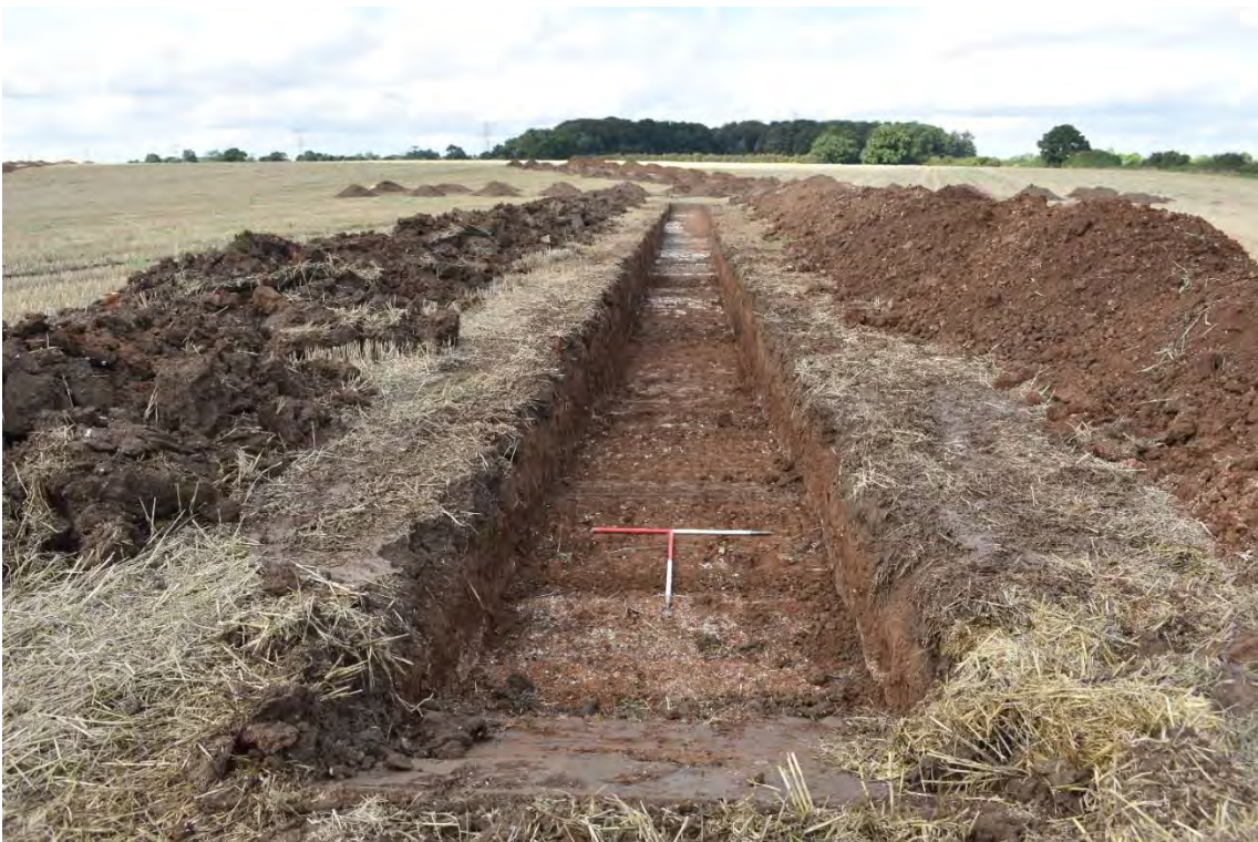
Plate 2.30: Trench 82. Pre-excitation trench shot showing change in depth, looking north.