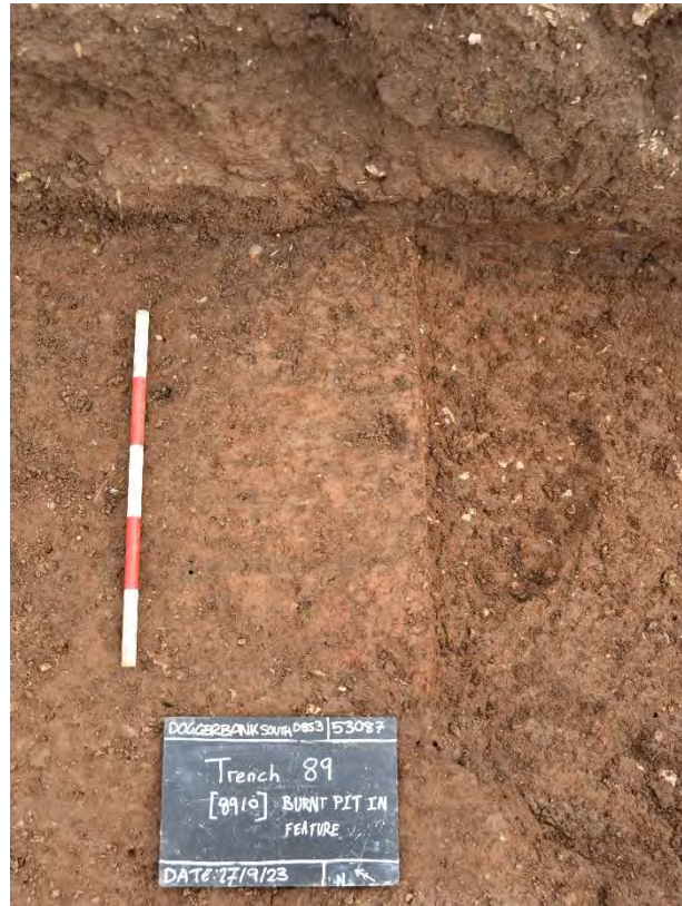
Plate 2.67: Trench 89. Southwest facing section of pit [8910], looking northeast.