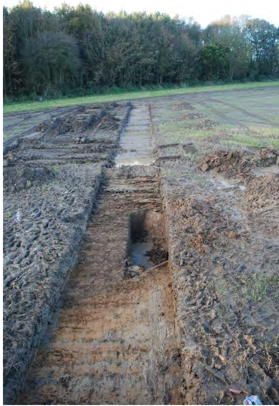
Plate 2.89: Trench 117. Plan view of ditch [11704], looking northwest.