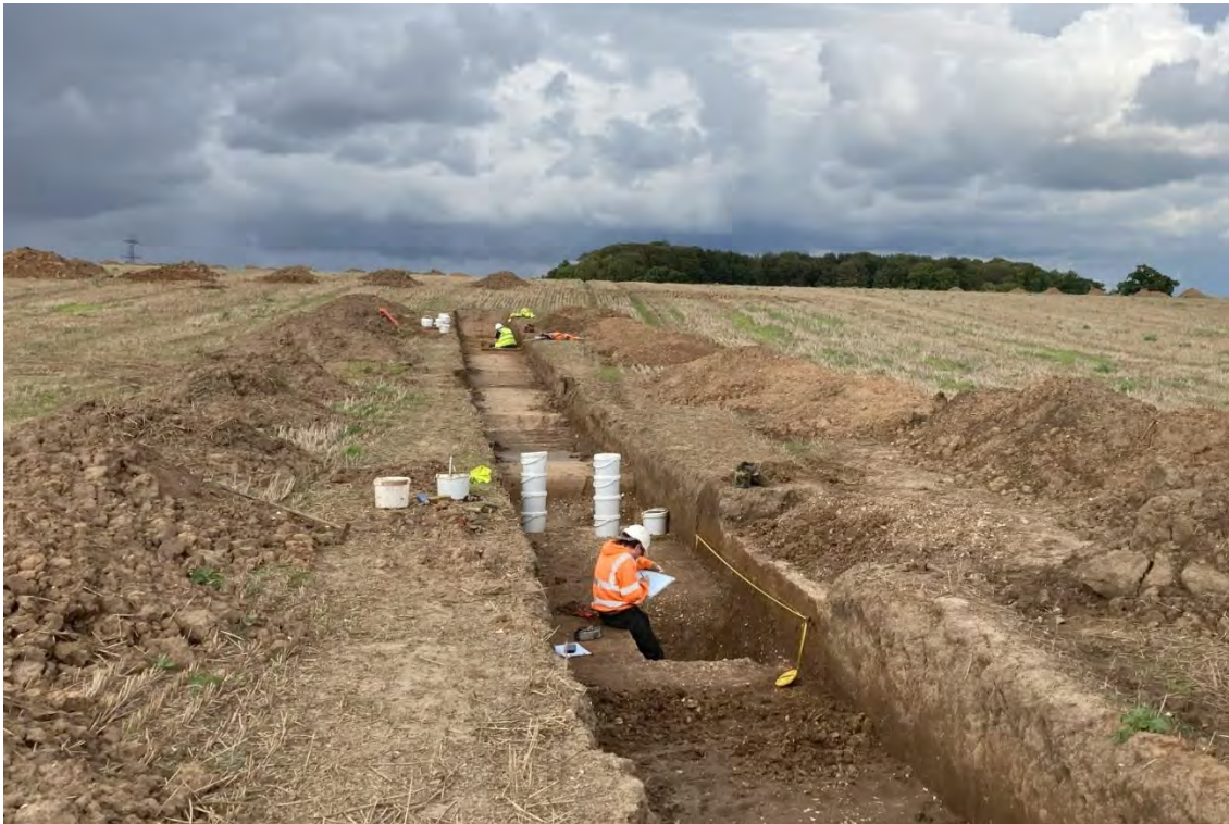
Plate 2.38: Working view of site staff in Trench 87 showing the slope upwards out of the valley base, looking north-northeast.