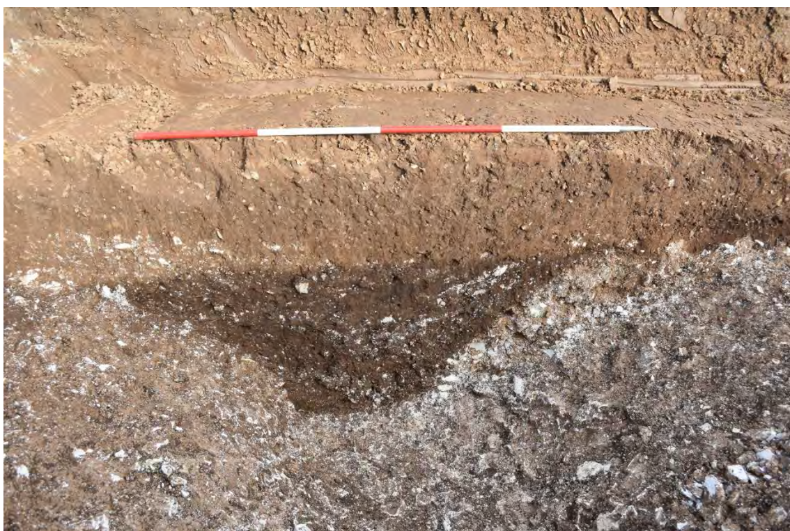
Plate 2.42: Trench 86. West facing section of trackway ditch Group DBS3/3, looking east.