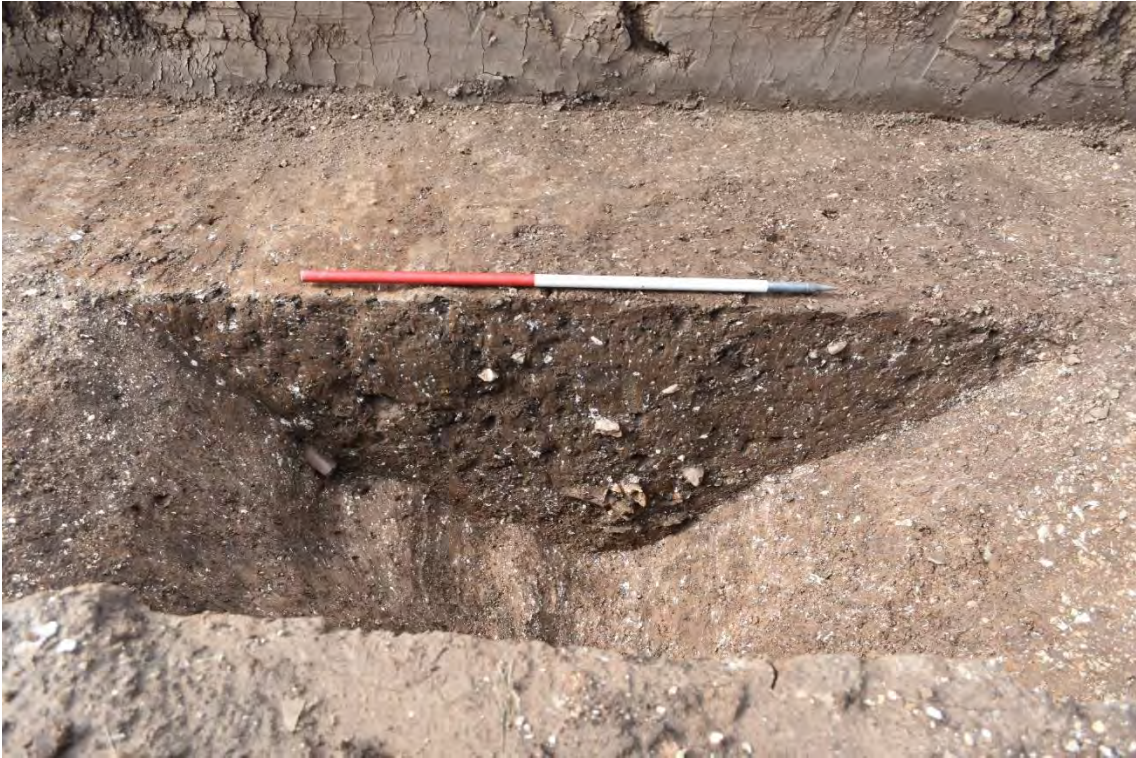
Plate 2.37: Trench 87. East facing section of [8704] (Group DBS3/1), looking west.