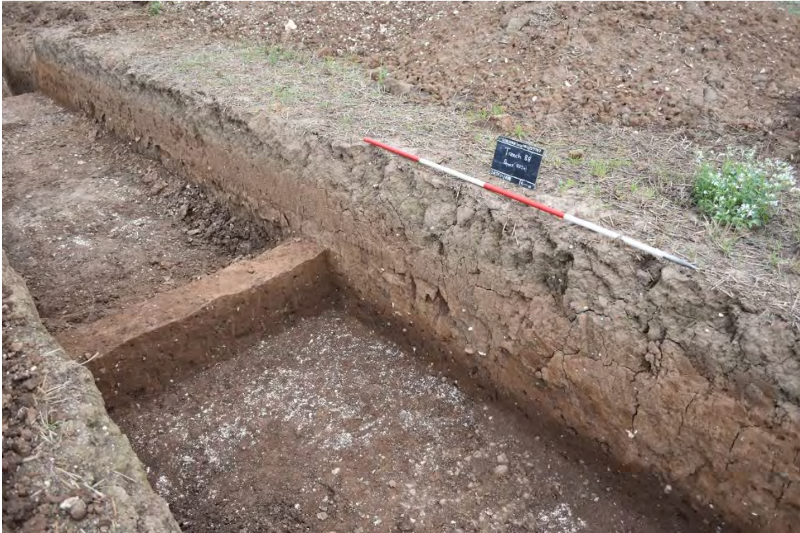
Plate 2.59: Trench 88. West facing section of colluvial deposit (8824) (Group DBS3/8), looking east.