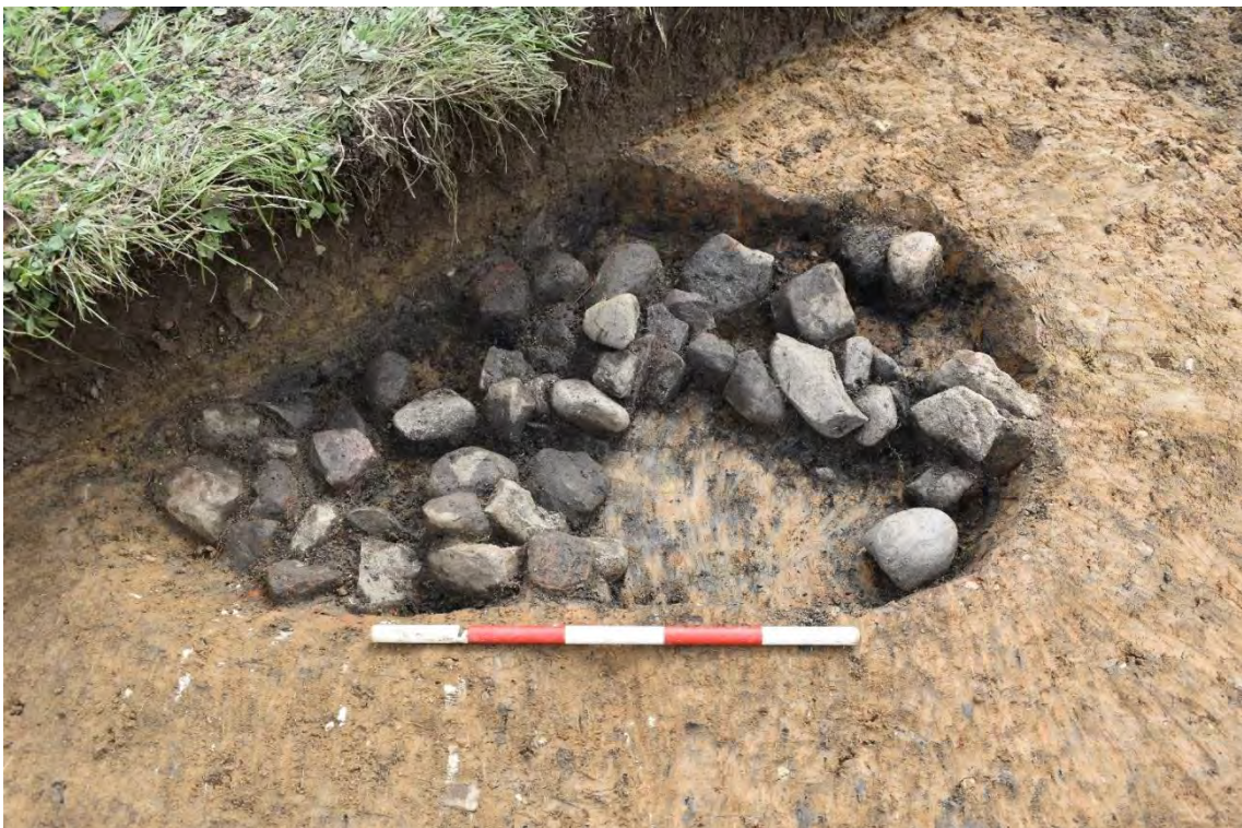
Plate 2.16: Trench 66. Plan view of stone fill 6615 in pit [6603], looking south.