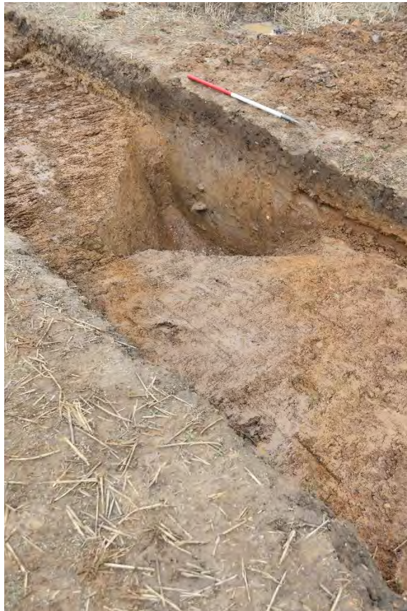
Plate 2.20: Trench 75. Plan view of ditch recut [7502], looking north.