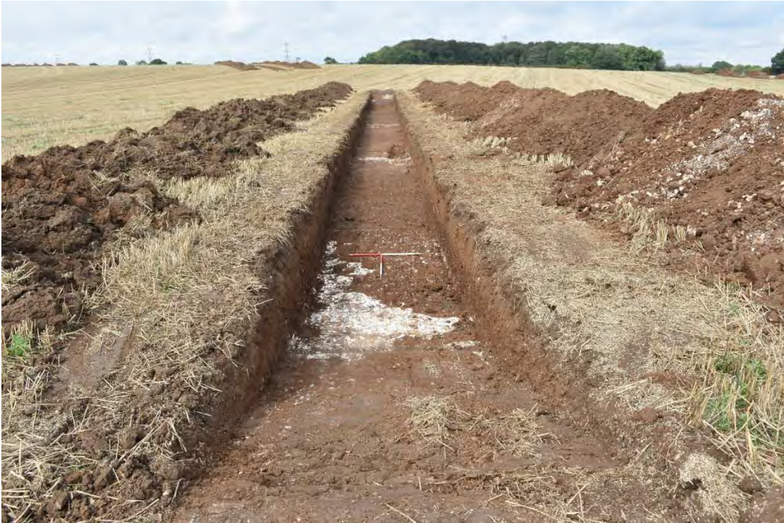
Plate 2.31: Trench 89. Pre-excavation trench shot, showing depth of overburden deposits. Looking north.