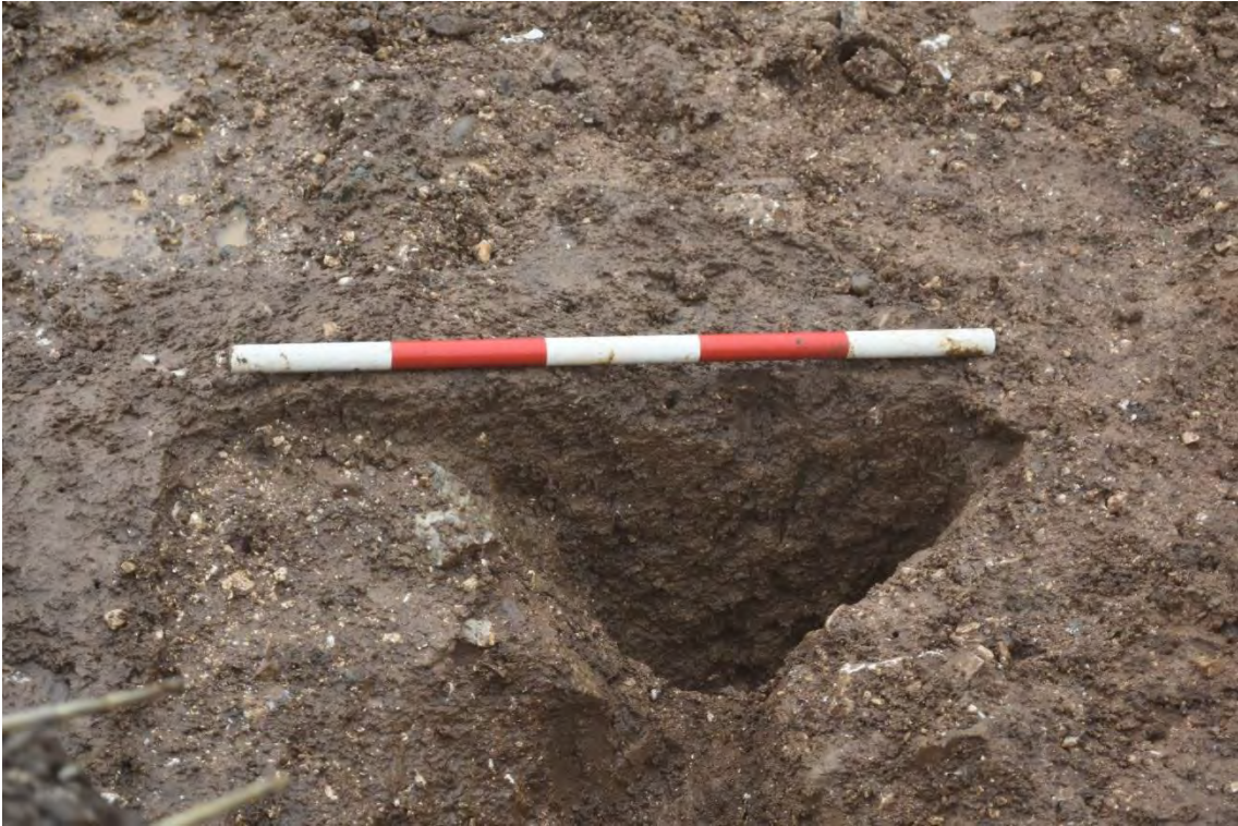
Plate 2.69: Trench 83. Southwest facing section of pit [8305], looking northeast.