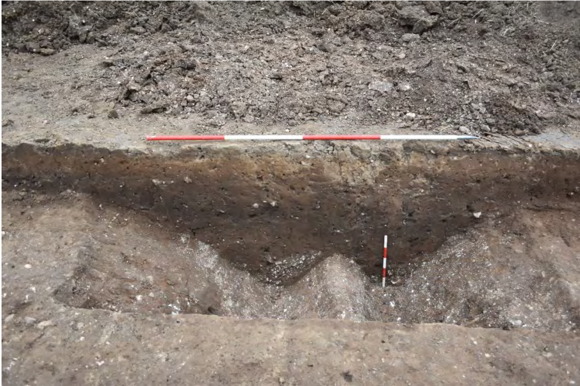
Plate 2.35: Trench 89. West facing section of ditches [8912] and [8915] (Group DBS3/1), looking east.