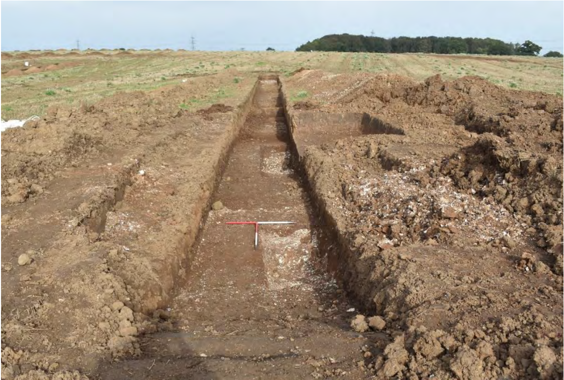
Plate 2.27: Trench 88. Post-excitation trench shot, looking north.